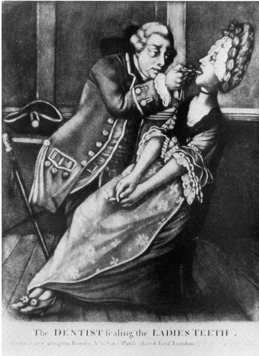
Figure 2 “The dentist scaling the ladies teeth”. Mezzotint, hand coloured, c. 1770, printed for Carrington Bowles. R. A. Cohen Collection.