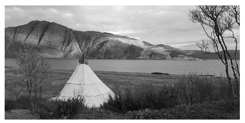
Figure 12.1 Varanger peninsula: Meahcci or ripe for quartzite extraction? Foreground: Sámi tent. Background: the scarred side of the mountain where company Elkem plans to extend quartzite mine.

pastures inland to summer pastures on the coast. The landscapes contain nutrients to sustain such webs of life infinitely, animals and landscapes mutually sustaining each other through centuries. For an outsider, the landscape appears untouched, an obvious candidate for protection. But its siida leader is tired of being its warrior; tired of defending the age-old reindeer herding tradition left, right, and center, and tired of endless meetings with lawyers, local politicians, impact analysts, and Elkem representatives (Österlin & Raitio, 2020).