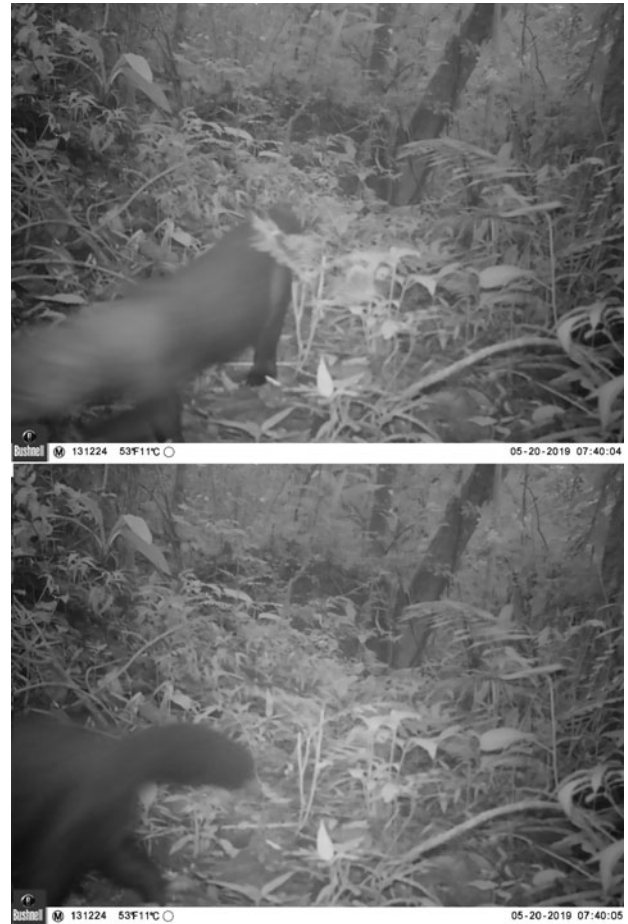
PLATE 1 The two camera-trap photographs of the bush dog Speothos veneticus obtained on 20 May 2019 in the municipality of Santa Rita do Sapucaí, in the state of Minas Gerais, Brazil (Fig. 1).

Ethical standards This research followed ethical procedures for conducting camera-trapping (Sharma et al., 2020), the cameras only recorded photographs of wildlife, and this research otherwise abided by the Oryx guidelines on ethical standards.