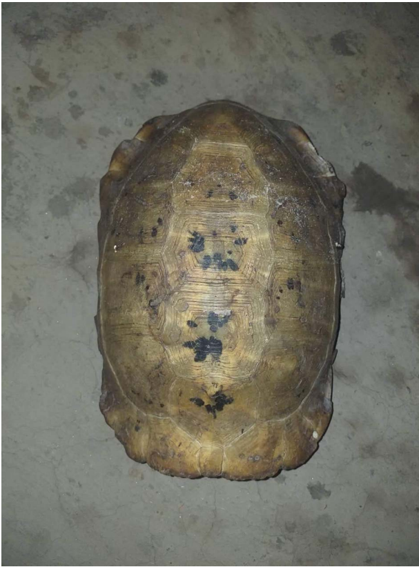
PLATE 2 A yellow-headed tortoise from Jalthal Forest killed on 10 July 2022.