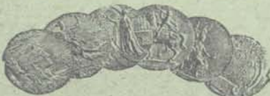
Gold Medal Allahabad 1910.

Paris 1900, Brussels 1910, Buenos Aires 1910.