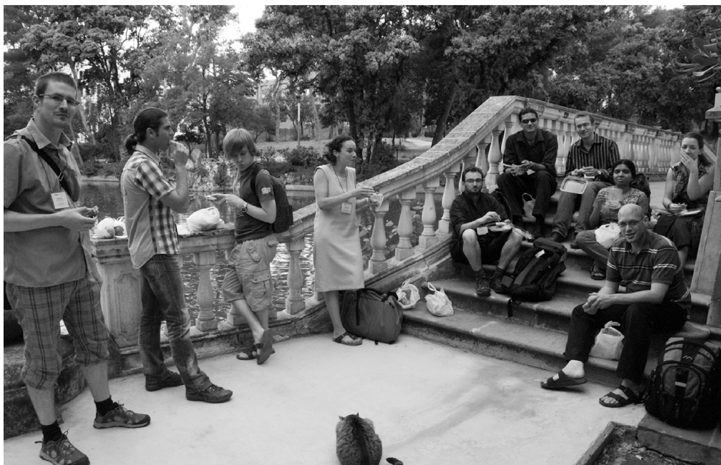
Lunch at Mare Nostrum shared with a cat