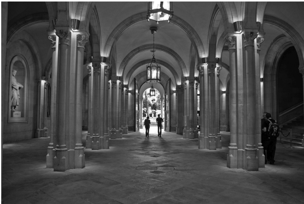
Historic Building's hall of the University of Barcelona