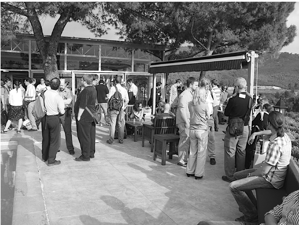
“Piscolabis” (snack) at Masia Torreblanca