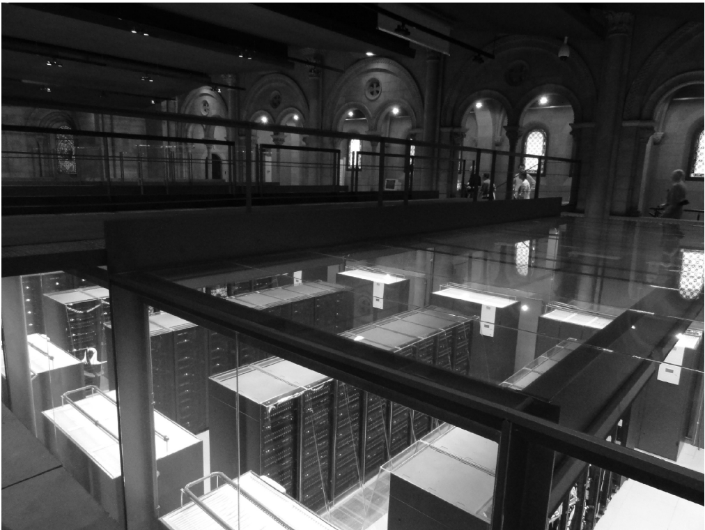
Visit to Mare Nostrum