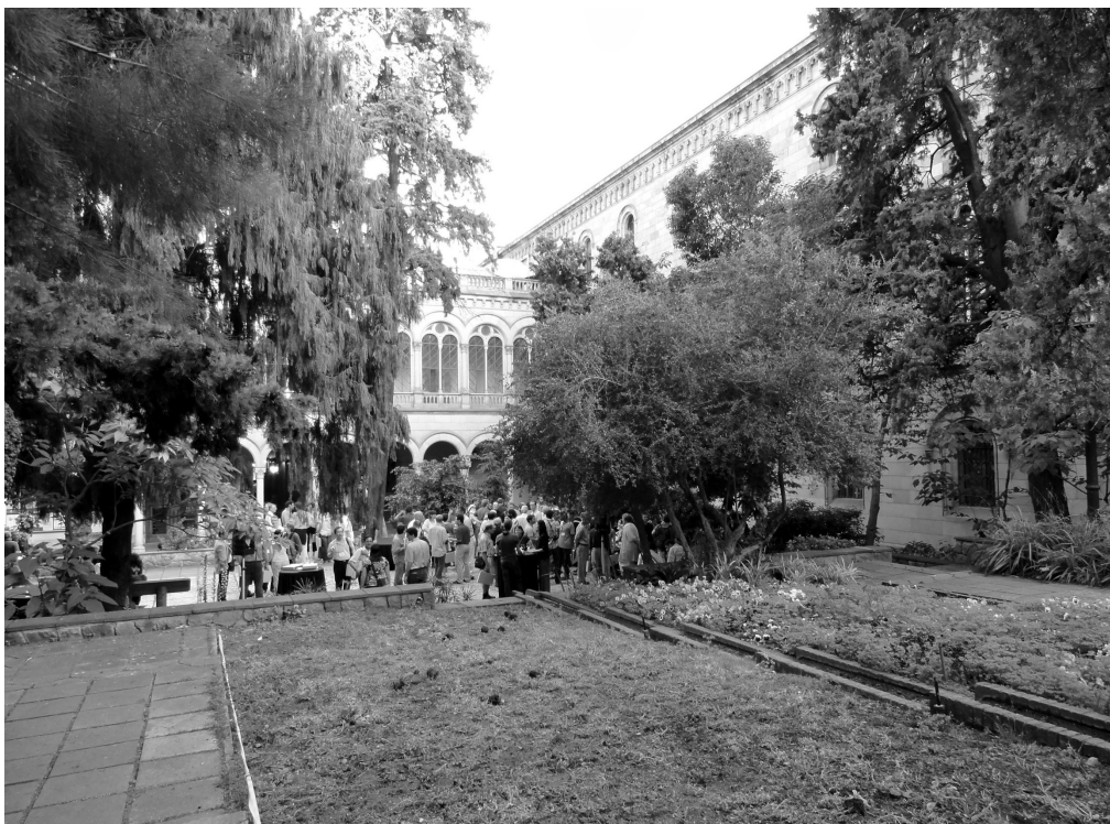
Sunday's reception at the historic building of the University of Barcelona