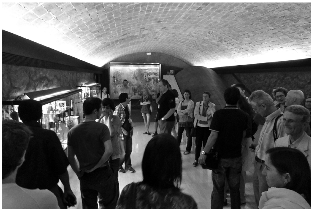
Visit to Caves Freixenet