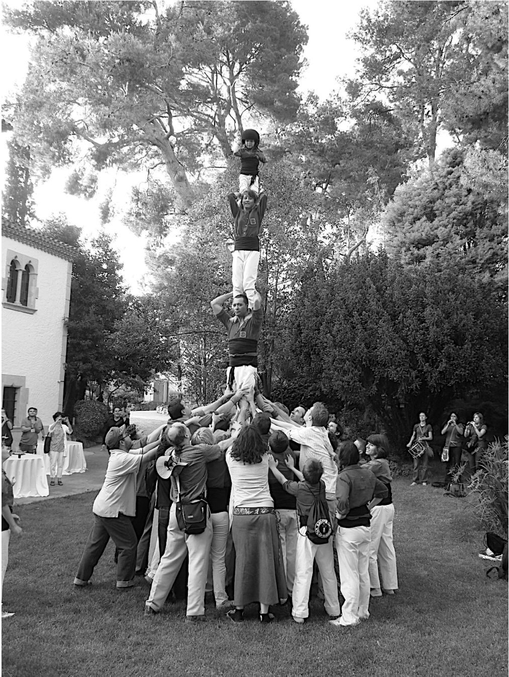
Human tower by the Colla castellera Xicots de Vilafranca and some meeting's participants volunteers