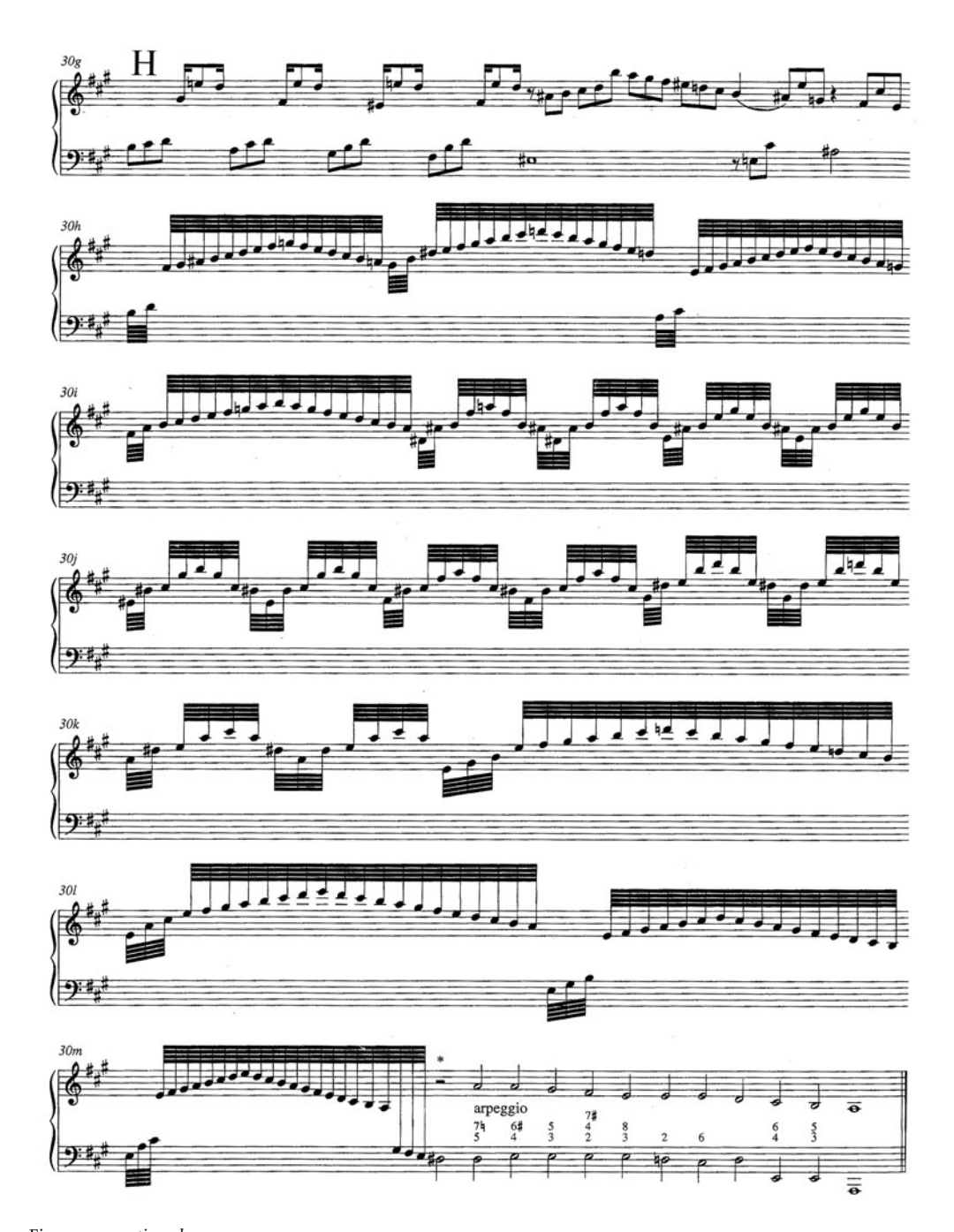
Figure 3 continued