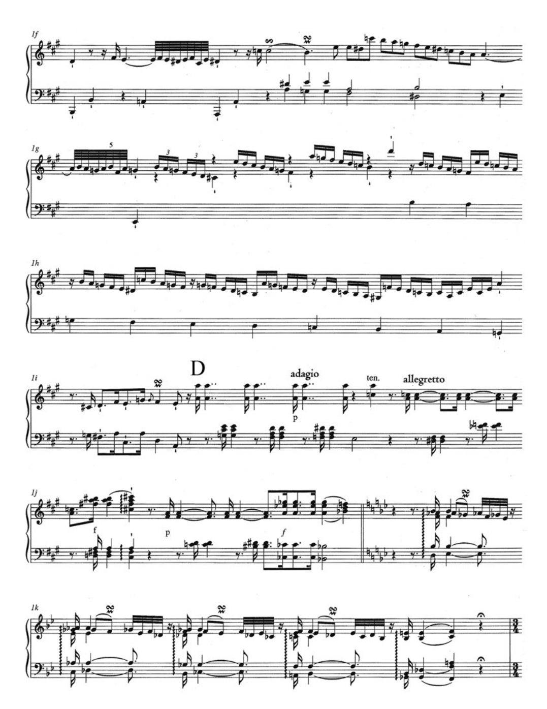
Figure 3 continued