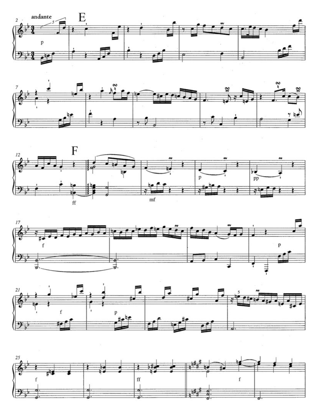
Figure 3 continued