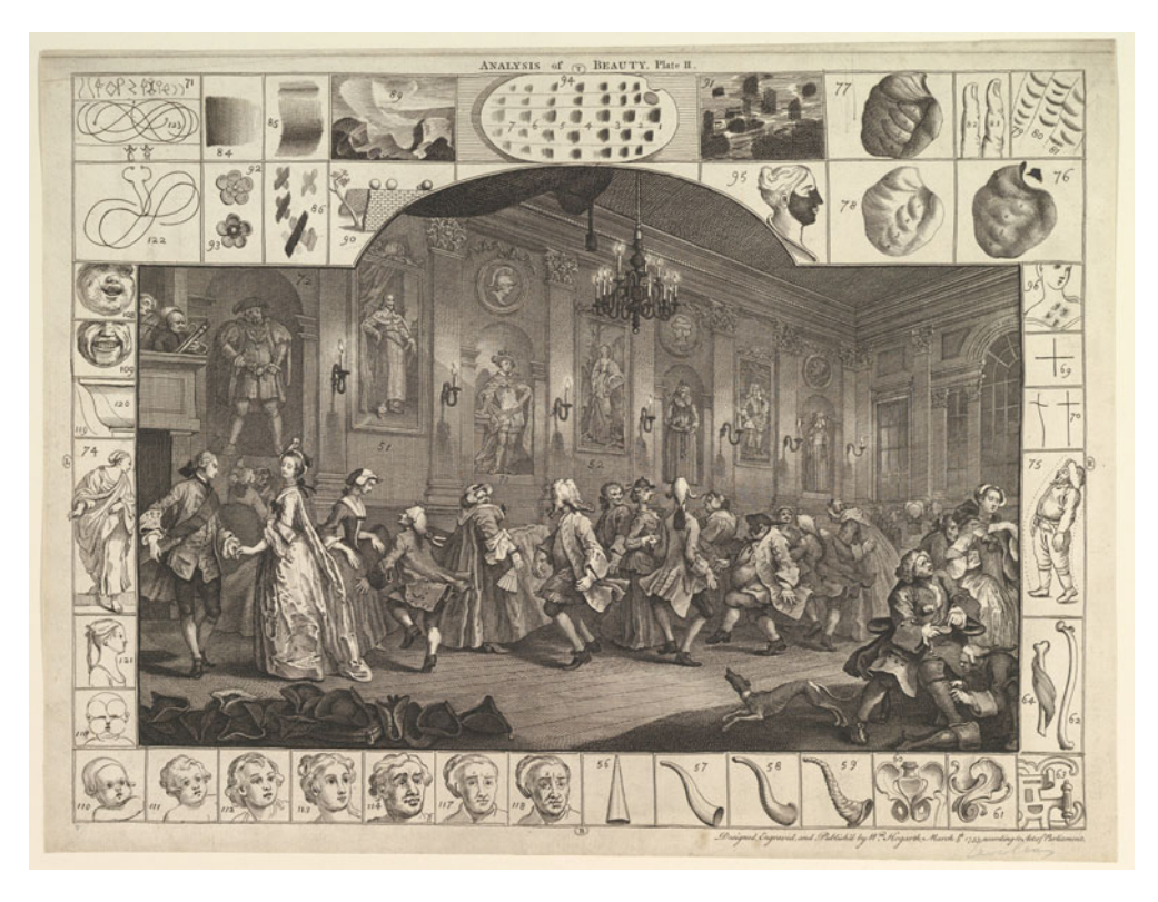
Figure 4 (Colour online) William Hogarth, 'A Country Dance in a Long Hall', The Analysis of Beauty , plate 2 (London: Hogarth, 1753). The Wellcome Library, London. Used by permission