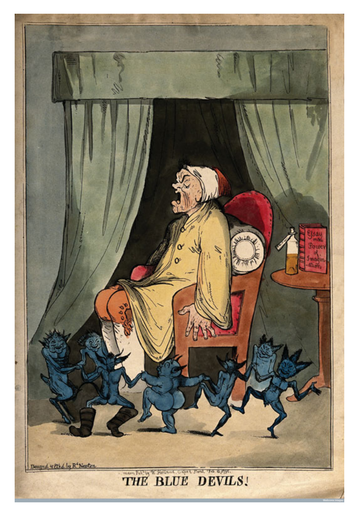
Figure 1 (Colour online) Richard Newton, 'The Blue Devils'. Coloured etching, self-portrait (London: Holland, 1795).

hole, echoes the bizarre physicality of the mischievous devils, emaciated and corpulent, human and animal, ambiguously sexed. On the table a flask of wine or spirits suggests both the cause of and the relief for the malady, and hints perhaps that the sufferer is inebriated. (It is worth noting that Bach's wife, Johanna Maria Dannemann, was the daughter of a wine merchant.) Next to the flask is a book entitled Essay on the Power of Imagination , after Joseph Addison's famous essay from The Spectator of 1712, an ironic illusion given the torments of the sufferer's disordered fancy.