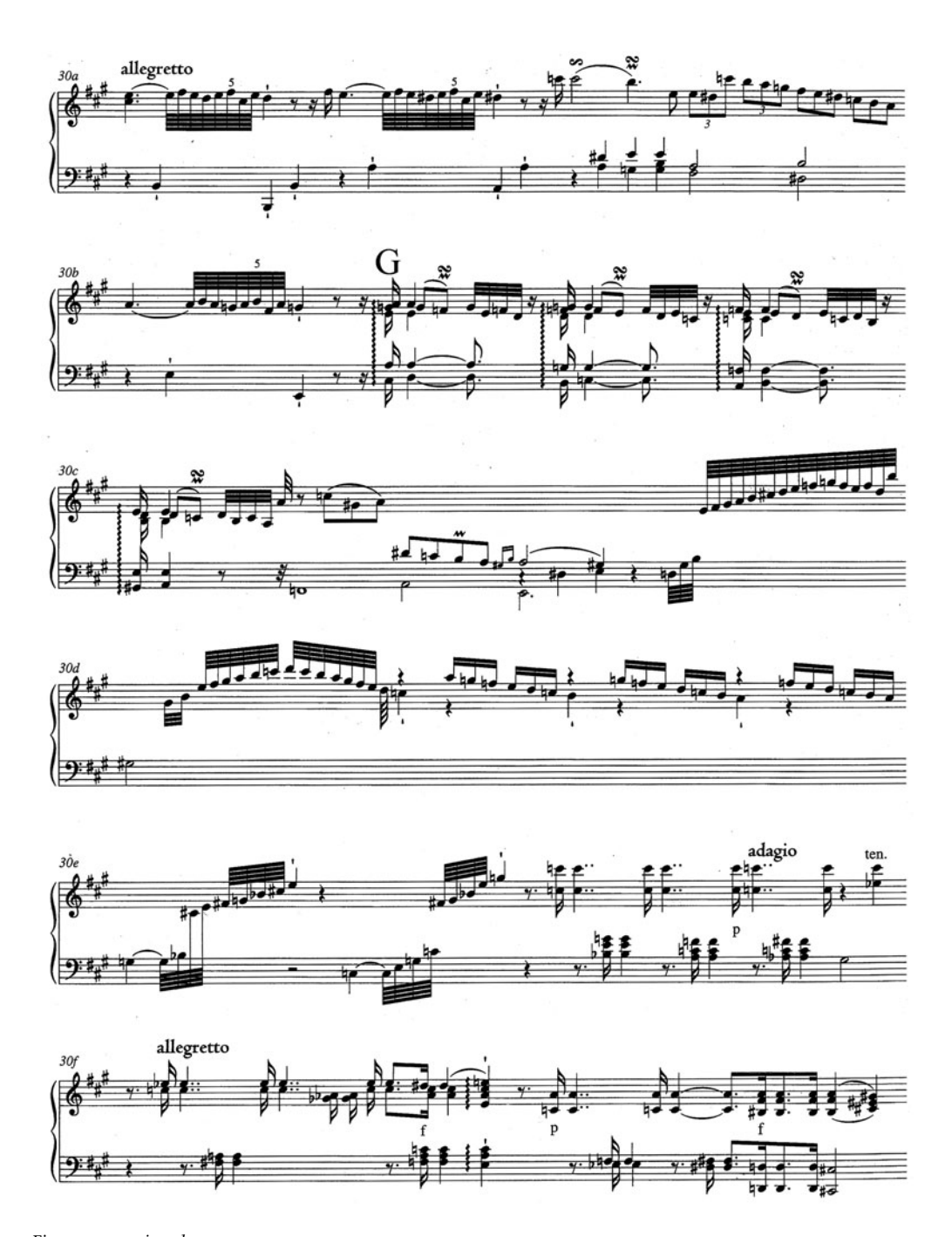
Figure 3 continued