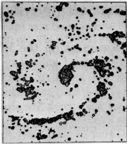
Fig. 1 H\alpha isophotes of NGC 4321 using the TAURUS camera on the the 4.2m William Herschel Telescope, La Palma. Subarcsec resolution was obtained over the whole image. Contour interval is 0.47 instrumental magnitudes. Lowest contour at 5 times r.m.s. sky level (see Cepa & Beckman 1990a).

ABSTRACT. We apply a newly devised quantitative technique to infer the relative arm/interarm star formation efficiency ratio in NGC 4321, revealing a complex but clearly defined density wave structure pattern.