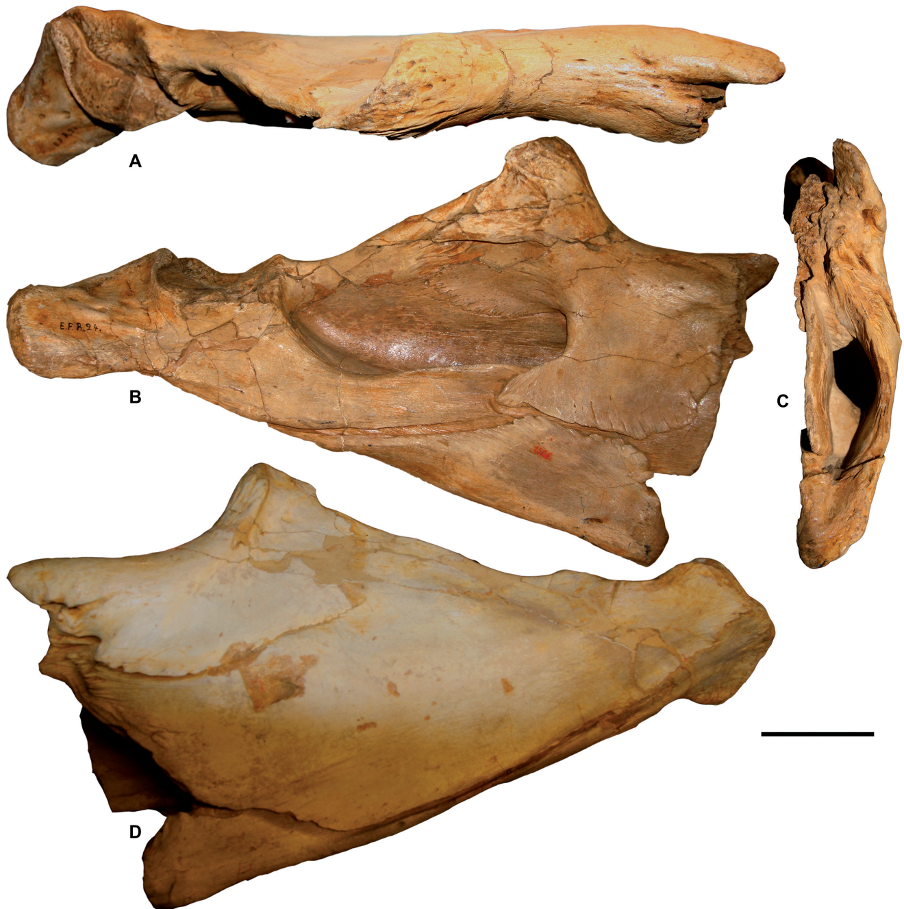
Fig. 2. Prognathodon saturator Dortangs et al., 2002, posterior mandibular unit IRScNB R24, in dorsal (A), medial (B), anterior (C) and lateral (D) views. Scale bar equals 10 cm.

margin. The posterior portion of the coronoid is dorsoventrally wide and broadly overlaps the surangular. In medial view the surangular is largely covered on three sides by the other constituent elements of the PMU, but a large central portion is exposed and provided a portion of the insertion of the adductor muscles. The articular is deeply emarginated dorsally by this insertion area just anterior to the glenoid, the anterior portion has parallel sides and is obscured anteriorly by the coronoid. Posteriorly, the articular is sharply deflected medially, forming the retroarticular process. In medial view the coronoid is broad and dorsoventrally deep, the ventral portion overlapping the