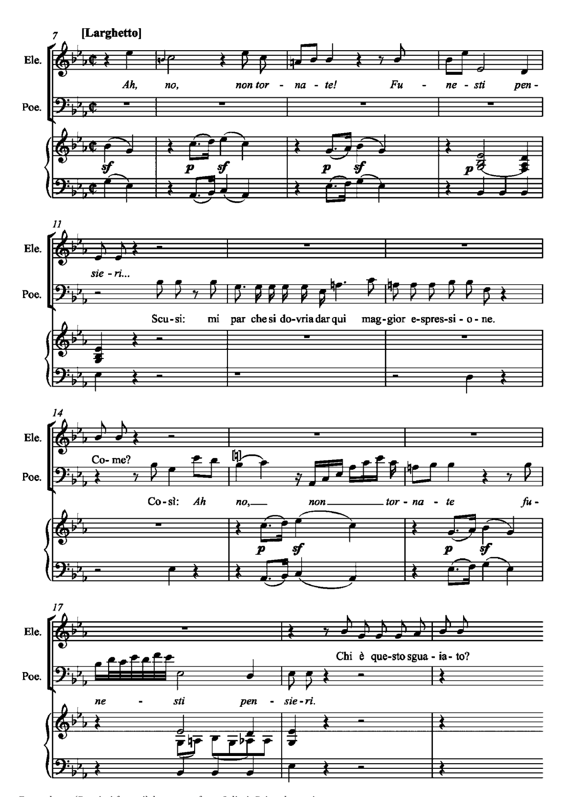
Example 9 'Pensieri funesti', bars 7–19, from Salieri, Prima la musica , 36–37