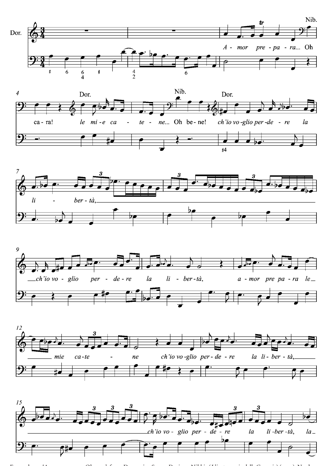
Example 2 'Amor prepara – Oh cara', from Domenico Sarro, Dorina e Nibbio (L'impresario delle Canarie) (1724), Naples, Biblioteca del Conservatorio San Pietro a Majella, Ms. 31.3.19, 71v–72