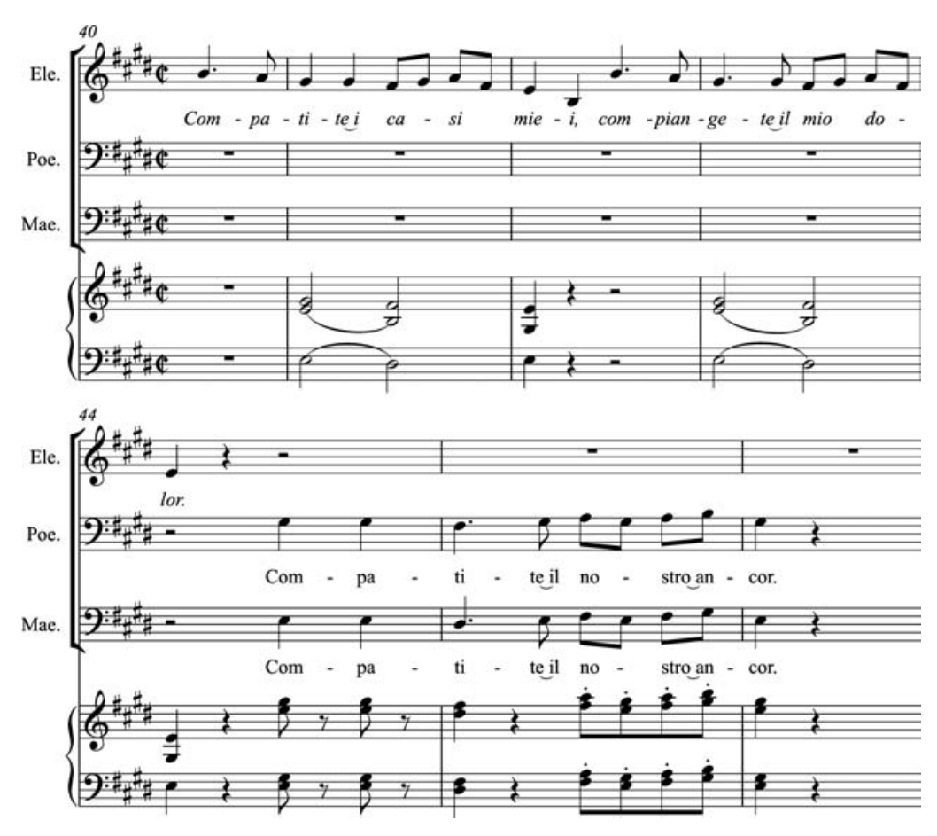
Example 13 'Compatite i casi miei', bars 40-46, from Salieri, Prima la musica, 61

ironically sets the deep sorrow for Sabino, who is going to die, against the pain of these two comic figures, forced to hold an uncomfortable posture (see Example 13):