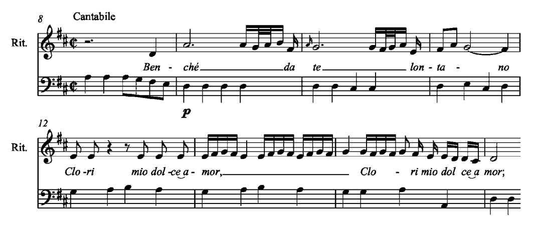
Example 6 'Benché da te lontano', bars 8–15, from Gassmann, L'opera seria, 105–106

This change of musical style reflects the dramaturgical passage from the fictional performance of the song to the addressing of the other characters. (The change, therefore, is similar to that found in Example 5, from L'amore in musica .) After the moment of surprise, however, Ritornello returns to a sort of (mock-)operaseria aria style to conclude his performance (Example 8). One wonders whether the other characters hear Ritornello sing throughout, or hear him speak during the last two lines. The setting seems to suggest that