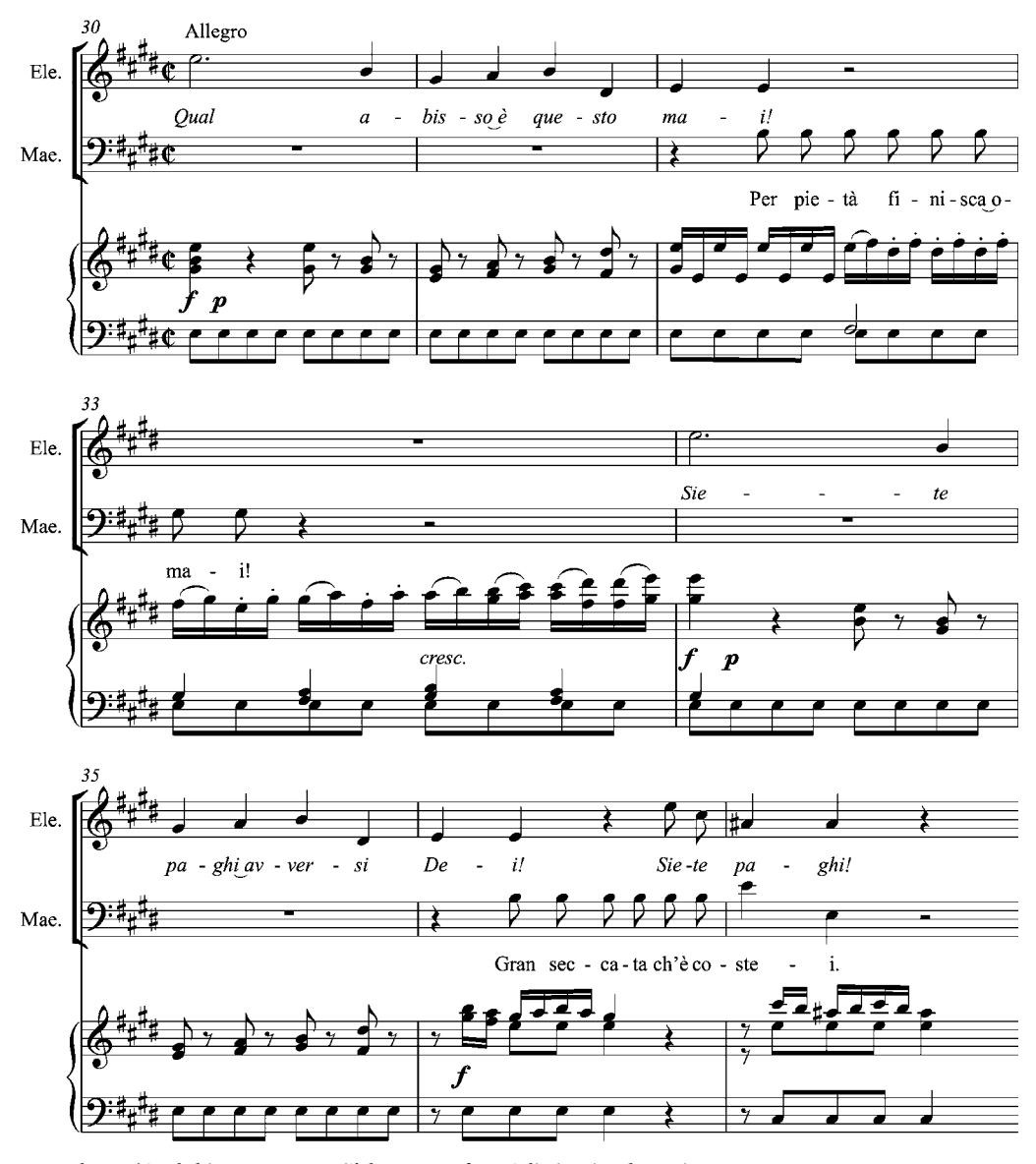
Example 12 'Qual abisso è questo mai!', bars 10–17, from Salieri, Prima la musica, 60

Ele. Siete paghi, avversi Dei? Poe. Gran seccata ch'è costei!<sup>34</sup>