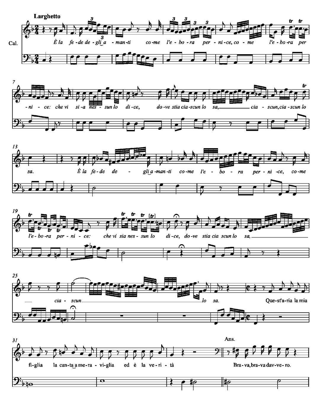
Example 5 'È la fede degli amanti', from Antonio Boroni, L'amore in musica (1764), Naples, Biblioteca del Conservatorio San Pietro a Majella, Ms. 25.6.8–10, 61v–64

perfectly integrated with the preceding text (the settenario rhymes with the settenario of the previous line, and the quinario rhymes with the quinario concluding the first stanza). Combined, however, these last two lines can also be read as an endecasillabo (that is, as part of a recitative). In other words, the text of the second stanza above could also have appeared this way: