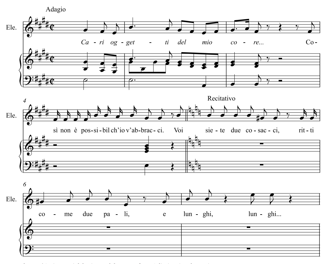
Example 10 'Cari oggetti del mio core', bars 1-7, from Salieri, Prima la musica, 54

After having repositioned the two 'children', Eleonora starts the piece again from the beginning. Poeta and Maestro intervene in the instrumental coda, complaining about the uncomfortable position they have to hold. This remark obviously interrupts the performance, and the 'number' slips into five bars of secco recitative in which Eleonora orders the two to keep quiet (Example 11).