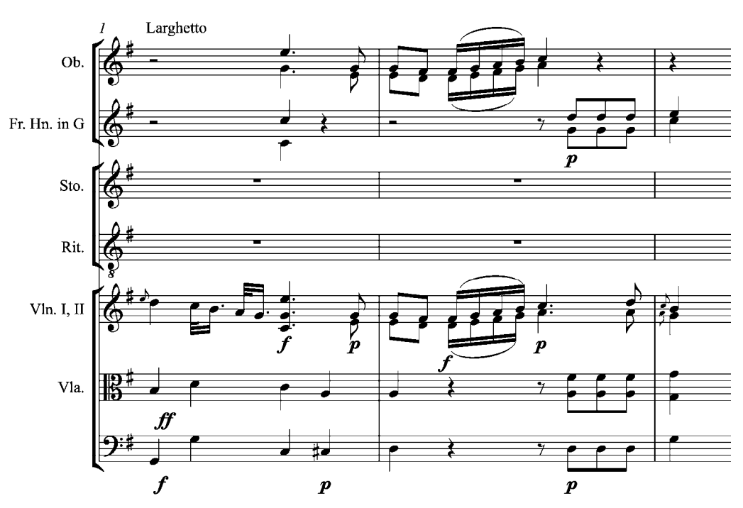
Example 4 Gassmann, L'opera seria, 276, bars 1-3 (second version)

The first variation on standard practices prompted by the presence of realistic music can be observed within closed numbers. One interesting example is in the opera buffa L'amore in musica (music by Antonio Boroni to a text by an unknown librettist; Venice, Teatro San Moisè, 1763). In Act 1 Scene 4 Calandra, mother of the virtuosa Reginella, in praising her daughter's singing skills, 'quotes' (mangling all the words) from one aria by Metastasio (or 'Metanasio', as the fictional maestro di cappella later calls him), receiving the compliments of another character, Anselmo:<sup>23</sup>