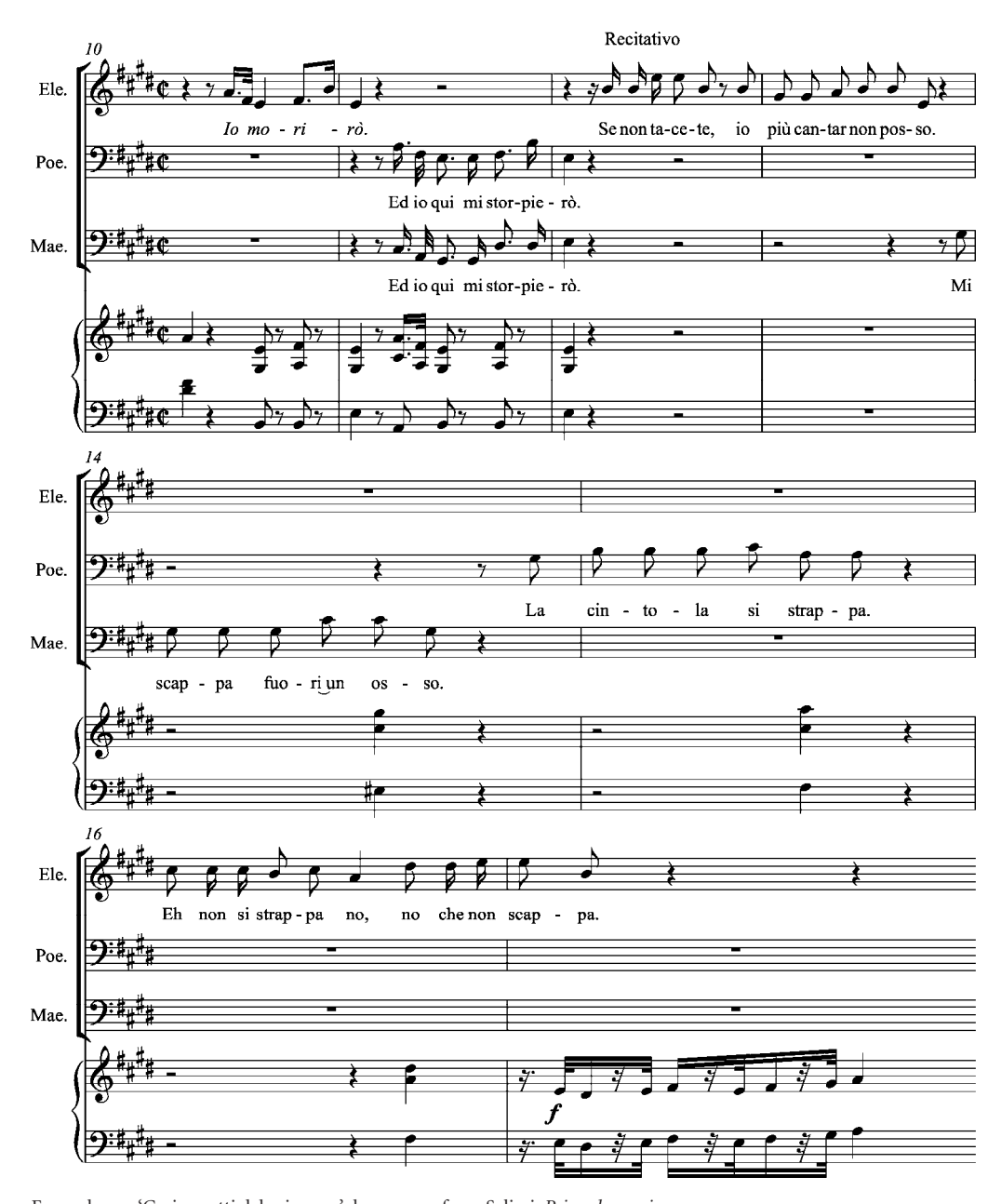
Example 11 'Cari oggetti del mio core', bars 10–17, from Salieri, Prima la musica , 57

The second part of the rond\delta is an allegro. Eleonora is now too deeply absorbed in her character to care about Poeta's and Maestro's complaints. In this section we do not find any interruption in simple recitative; instead, the first level of fiction (the uncomfortable presence of Poeta and Maestro) is completely integrated into the texture of the seria piece. The effect is comic (see Example 12):