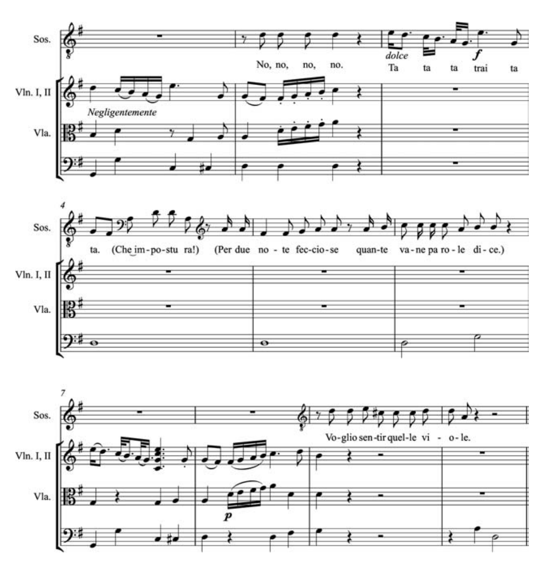
Example 3 'No, no, no', bars 1–10, from Florian Leopold Gassmann, L'opera seria , Introduction by Eric Weimer, Italian Opera, 1640–1770, volume 89 (New York: Garland, 1982), transcribed from the facsimile edition of the manuscript score held at the Österreichische Nationalbibliothek, Vienna, Ms. 17775, 275–276

expressive as the rehearsal goes on. Once again, the stratified nature of meta-opera is not confined to its dramatic plot, but is also reflected in its musical dimension: in the score we have, two 'realities' (the imaginary score and its fictional performance) cohabit and at times overlap in complex ways.