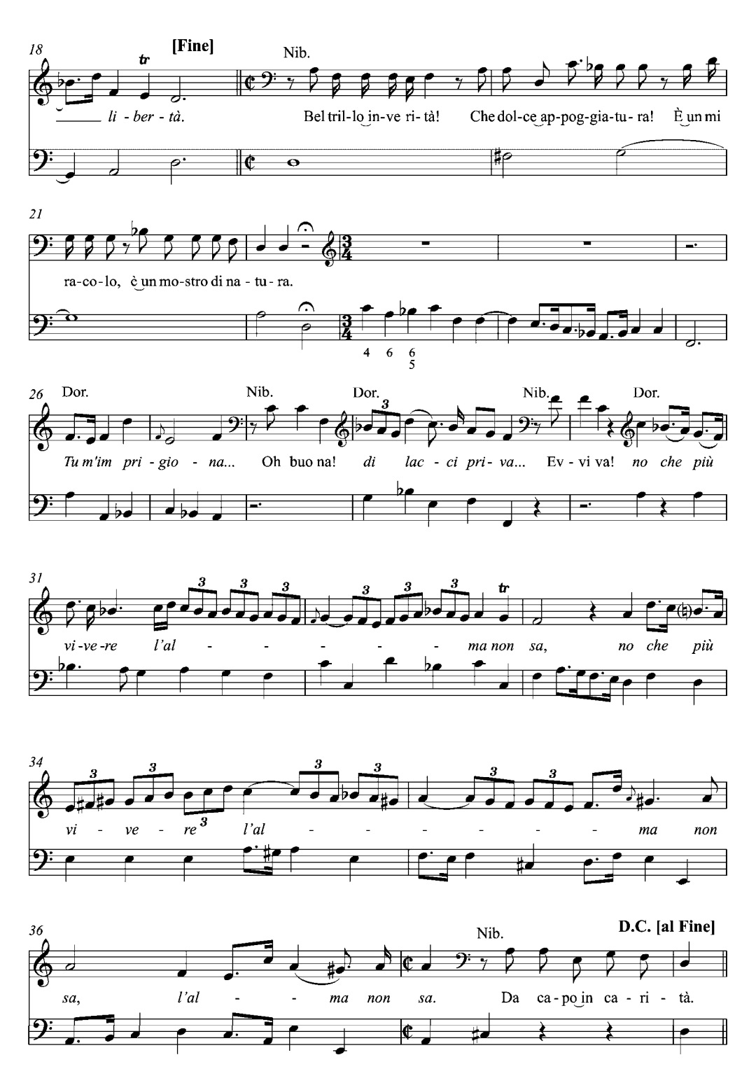
Example 2 continued