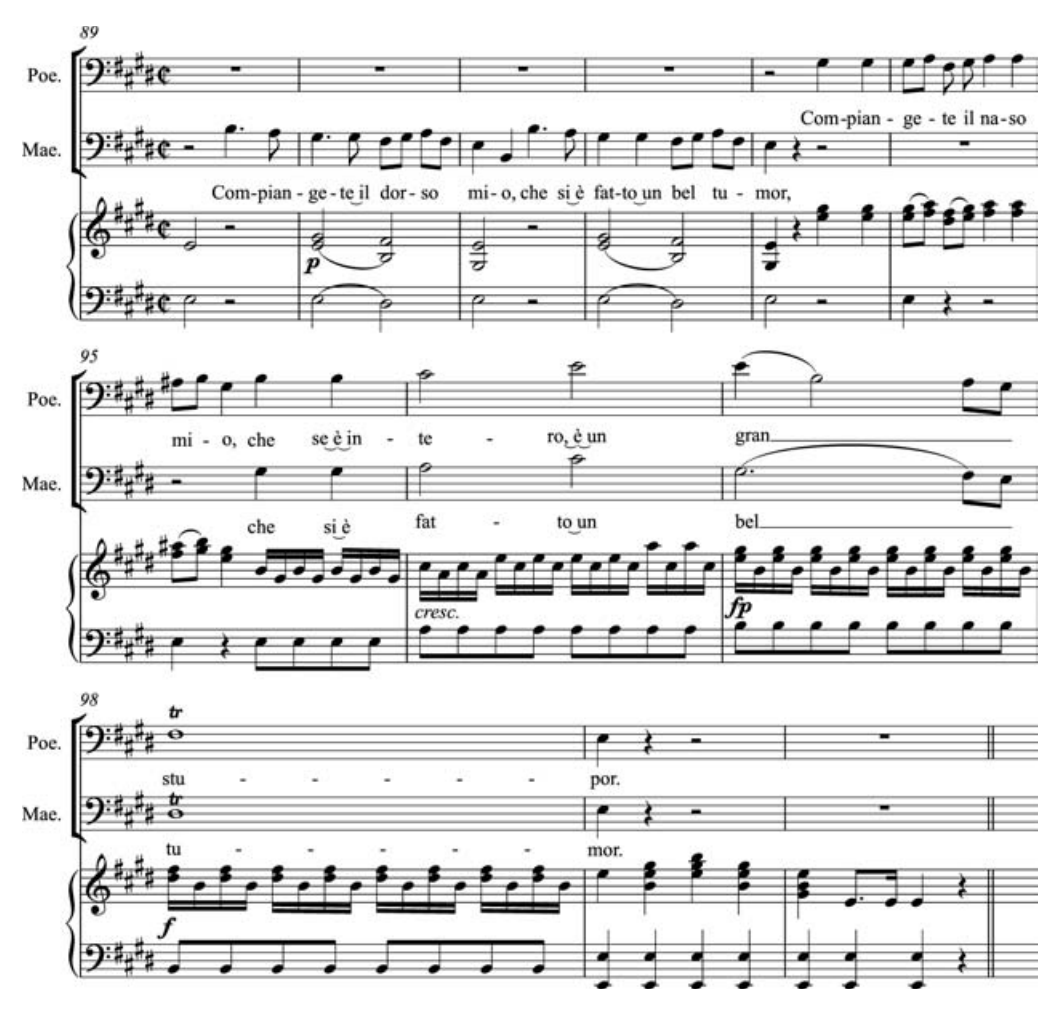
Example 14 'Compiangete il dorso mio', bars 89–100, from Salieri, Prima la musica, 65–66

Poe. Compiangete il naso mio, Che se è intero, è uno stupor.