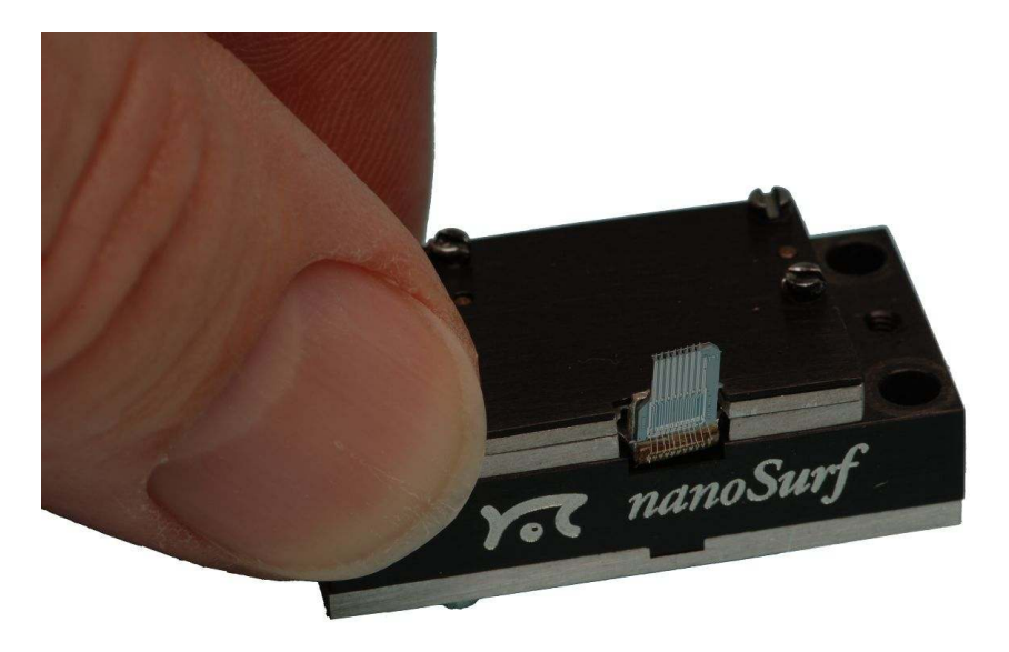
FIG. 1. AFM scanner of the Phoenix mission with mounted silicon chip showing 8 microfabricated cantilevers