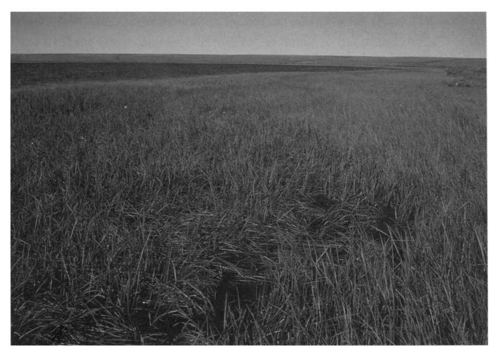
Figure 4. Trail of a crane and its young through the narrow strip of floating shoreline vegetation that is apparently needed for rearing offspring.

The view that Siberian White Crane numbers are limited by mortality during migration and in winter and that the tundra ecosystems provide food and habitat in abundance for them (Flint and Panchenko 1982) perhaps needs reassessment. It may be true that adults in summer have time to peck out roots from the marshy turf which is common on the tundra, but a pair with a chick apparently need to maintain a foraging rate of about five food items per adult per minute and this can be obtained only from the section of lakeshore with floating turf. It is this narrow (10–20 m wide) strip (Figure 4) which appears to be the key habitat for birds feeding a chick. I calculated that in 1989 on the 1,050 km<sup>2</sup> of my study area there were only 25 km of this type of lakeshore. Of this, the birds could use only about 18 km, as the other lakes were either too far from their normal routes or had steep banks without a zone of shallow water near the floating turf, so that a bird could not stand in water near the shore. In 1989 the monitored family of cranes used 13.5 km of such shoreline during one month. I therefore consider it likely that an important reason for the Siberian Crane's rarity and vulnerability is its dependence on a very restricted habitat during the chick-rearing period.