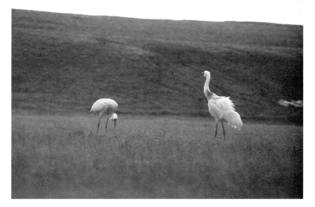
Figure 3. The pair at the nest in 1991 (Figure 1 was taken from the hill in the background). Both adults show the saddle-shaped stain on the lower neck, possibly a sign of a particular type of foraging associated with reproduction.

The brownish, saddle-shaped stain on the lower neck of adult cranes, mentioned earlier as a result of immersion when foraging, occurred in both birds during incubation and the chick-rearing period (Figure 3). In 1991 the pair lost this "paint" just after losing their chick, presumably because they changed their