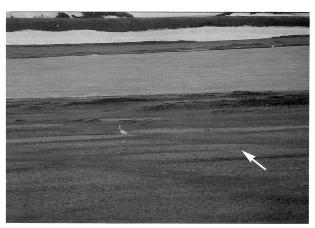
Figure 1. The nest-site in 1989 and 1991, showing the polygonal structure of the terrain and the associated lake hollows. The nest is arrowed.

silt of diatoms. The lake shore was marshy and formed by a floating layer of peaty turf composed of roots and rhizomes of sedge Carex lugens , cotton grass Eriophorum polistachion , kingcup Caltha palustris , and arctophila Arctophila fulva ; this layer was sometimes pushed towards the shore by the spring ice-sheet movements, forming an ice-shove ridge.