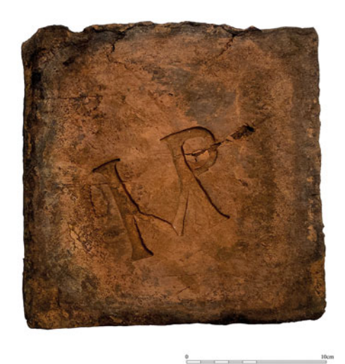
FIG. 8. Carlisle Cricket Club: Stamped hypocaust tile.

tiles were found and the evidence of ceramic, nozzled tubes and 'armchair voussoirs' suggests the presence of a vaulted roof. A key difference between the stacks of square hypocaust tiles recovered from the Hadrianic and Severan bath-houses is that the Severan hypocaust tiles frequently bore stamps. Twenty-nine tiles with an identical ligatured 'IMP' stamp, standing for imperator (emperor) have been recovered (FIG. 8). The same stamp has been found of roof tiles from other excavation sites in Carlisle, at Blackfriar's Street and at Annetwell Street. On the latter site there were indications that the tiles were produced at the beginning of the third century, specifically for the construction of the stone fort and its ancillary buildings<sup>30</sup>. The evidence from the Cricket Club site now demonstrates a larger programme of building.