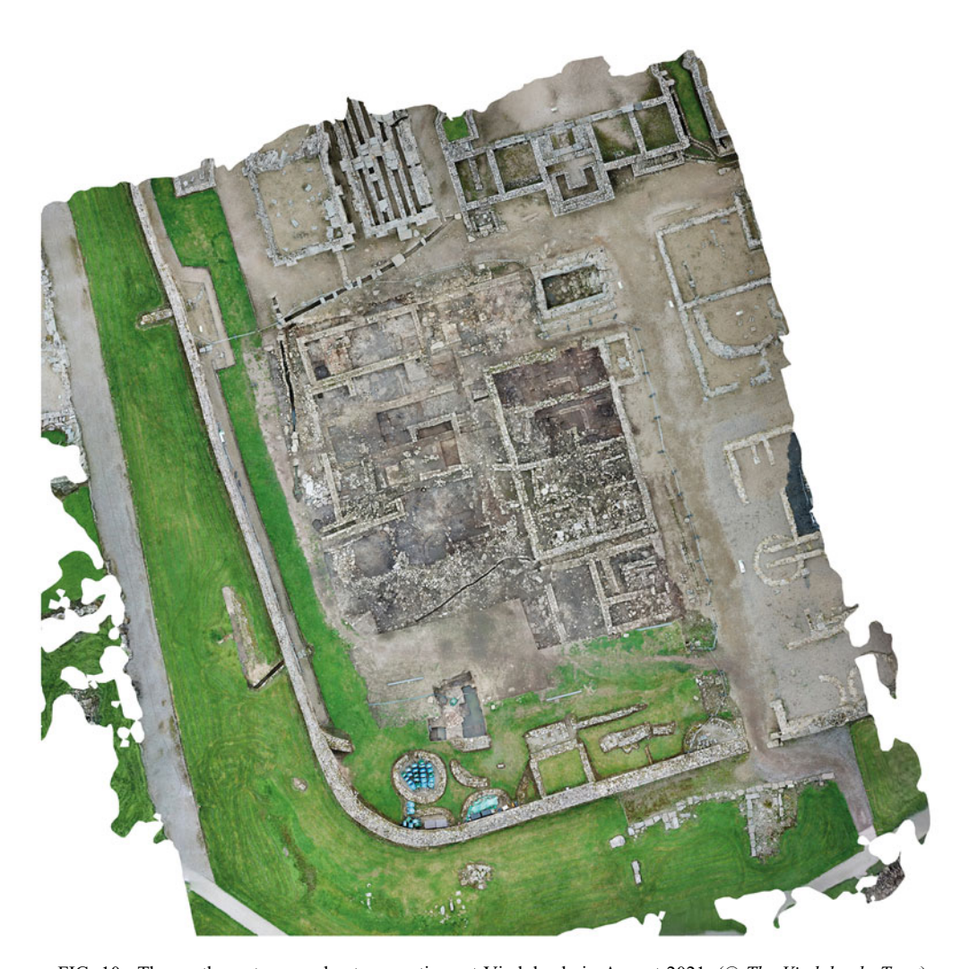
FIG. 10. The south-western quadrant excavations at Vindolanda in August 2021.

that encountered behind the cavalry barracks in the south-eastern quadrant, extended from the barrack buildings lining the side of the via decumana in the east to the intervallum road to the south and west. The cavalry barrack produced a variety of military equipment, which included several fine examples of lance heads and other associated cavalry equipment. The primary floor surfaces within the barracks were a mixture of cobble stones packed with clay and flagstone set in clay foundations. Although several rooms were extensively damaged by later sub-Roman and post-Roman constructions, an examination of the internal dimensions and appointments of the rooms provided clear evidence for the separation of the living accommodation for soldiers and their horses. The domestic spaces, situated on the western side of the barracks, were furnished with clay ovens. Rooms that functioned as stables faced onto the via decumana , and were finished with rougher cobbled floor surfaces, some of which had sunken into central pits.