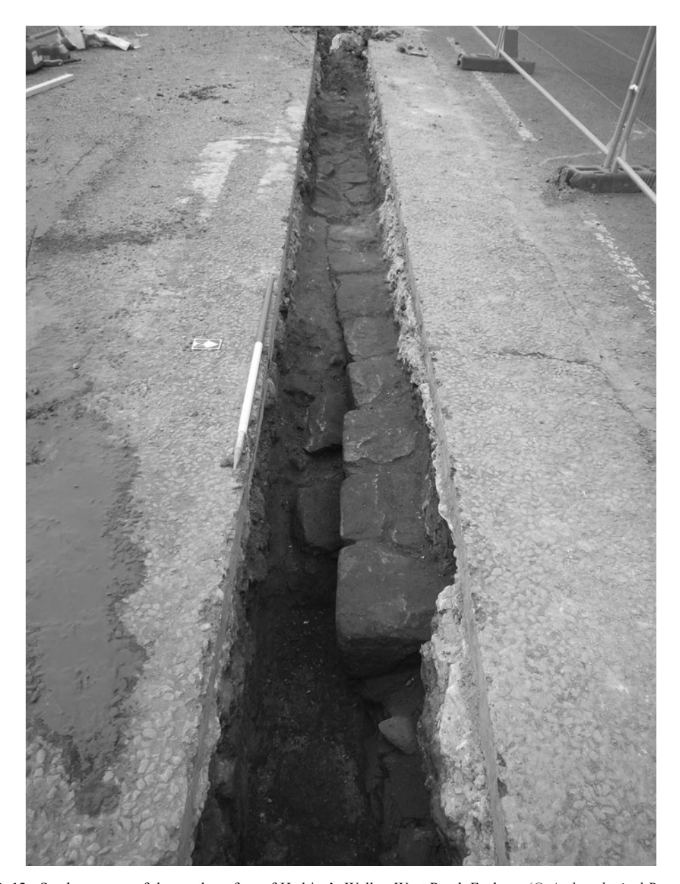
FIG. 12. Sandstone part of the southern face of Hadrian's Wall at West Road, Fenham.

wide, effectively forming one continuous trench. The trench was excavated to a depth of between 1.2 m and 1.6 m. At the junction with Newminster Road, approximately 155 m from the south-eastern end of the trench, a c. 4.5 m length of sandstone wall was revealed which is interpreted as representing part of the southern face of Hadrian's Wall (FIG. 12). The stonework