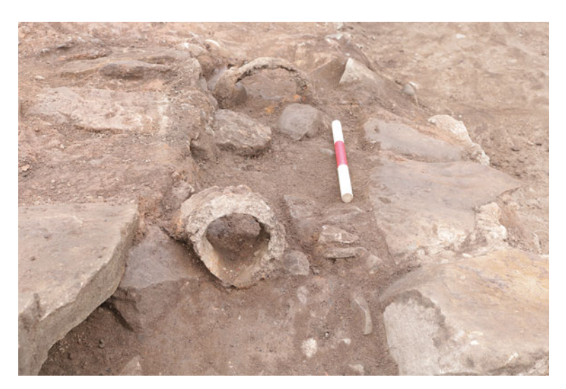
FIG. 5. Birdoswald: Iron water-pipe connectors, Area A.

Area B, which measured 14 × 11 m, was situated 35 m east of the principal east gate of the fort. Two stone-built strip-buildings facing onto the Military Way were excavated. One respected the width of the double gate portal, the second respected the width of the gate after its reduction to a single carriageway in the third century. They were built and floored in part with massive stone slabs. A rubble ridge, long recognised as an earthwork, and previously thought to represent spoil from the nineteenth-century excavation of the east wall, was proved to represent the northern walls of the strip buildings. Finds included two domestic portable altars (FIG. 6).