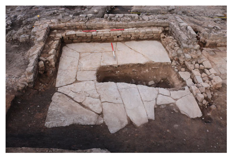
FIG. 4. Birdoswald: Stone floor of secondary building in Area A.

(1) Birdoswald ( Banna ) (NY 615 633): two areas were excavated in the eastern extramural settlement outside the Hadrian's Wall fort, the extent of which is known from previous geophysical survey. Area A measured 25×13 m and was positioned to locate and contextualise a building previously exposed briefly by Ian Richmond and interpreted as a signal tower. This building survived to 2 m in height, and steps led down to a semi-basement. To the north were further structures, part of a large complex identified in geophysical survey. A broad primary wall to a building east of the excavated area was abutted by an apsidal wall, the area between the walls being surfaced by regular flagstones. A stone bench-end was found laid on these flags. The wall of the apsidal structure was cut by a free-standing square stone building, floored with large slabs (FIG. 4). This building was associated with a bifurcated water-main; one branch broke through the walls of the apsidal structure, the other ran to the west of and parallel to the square building. The evidence comprised iron pipe-connecting rings (FIG. 5) set upright in narrow trenches. A thick and widespread deposit of soot and charcoal, together with box-flue tile fragments and spacer bobbins, suggest the very close proximity of the fort bath-house.