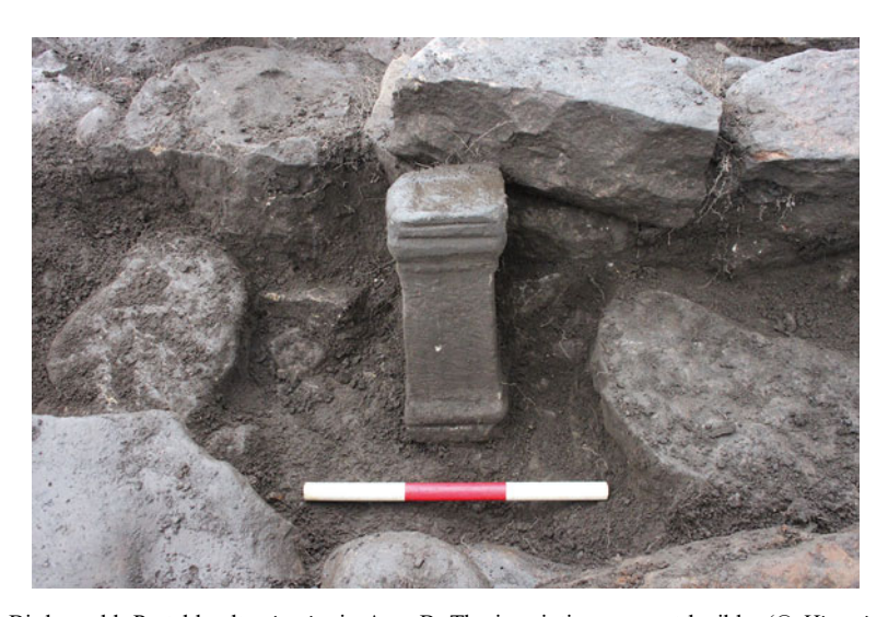
FIG. 6. Birdoswald: Portable altar in situ in Area B. The inscription was not legible.

Area B, which measured 14 × 11 m, was situated 35 m east of the principal east gate of the fort. Two stone-built strip-buildings facing onto the Military Way were excavated. One respected the width of the double gate portal, the second respected the width of the gate after its reduction to a single carriageway in the third century. They were built and floored in part with massive stone slabs. A rubble ridge, long recognised as an earthwork, and previously thought to represent spoil from the nineteenth-century excavation of the east wall, was proved to represent the northern walls of the strip buildings. Finds included two domestic portable altars (FIG. 6).