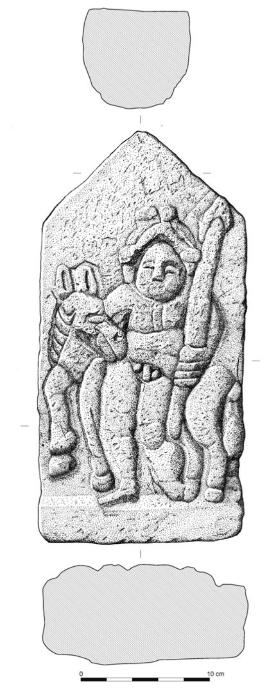
FIG. 11. The Vindolanda carved figure with mule.