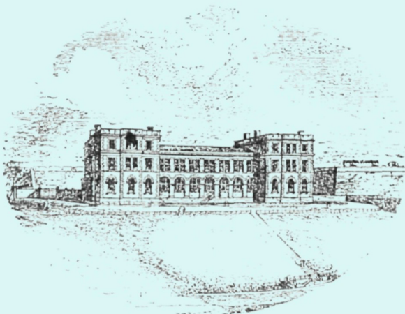
THE PLYMOUTH LABORATORY.