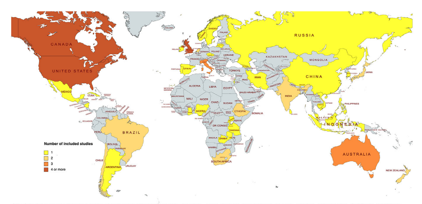
*The following countries were included in one or more multi-country studies: Malaysia, Japan, Ethiopia, Brazil, Nigeria, Uganda, UK, Iran, Italy, Portugal, Cambodia, Philippines, Spain, New Zealand, Usa, Sri Lanka, Chile, India, Republic of Korea, The Netherlandands, Zambia, Indonesia, Tanzania, Singapore, Lithuania, Australia, Georgia, Vietnam, South Africa, Ghana, Sweden, Argentina, Cuba, Jamaica and Mexico.