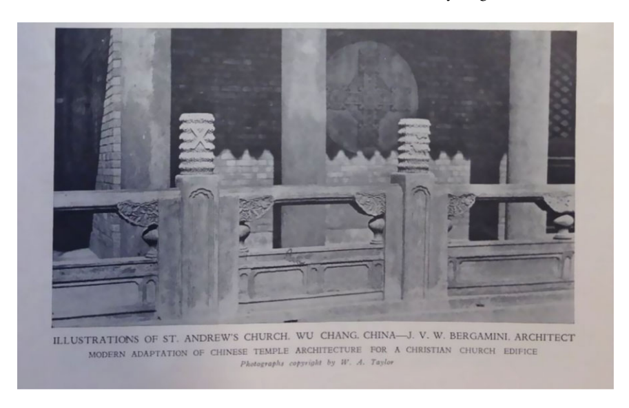
Figure 6. The American Architect, 5 June 1929. Note: Caption says: 'Illustrations of St. Andrew's Church Wu Chang, China – J.V.W. Bergamini, architect. Modern adaptation of Chinese temple architecture for a Christian church edifice'.