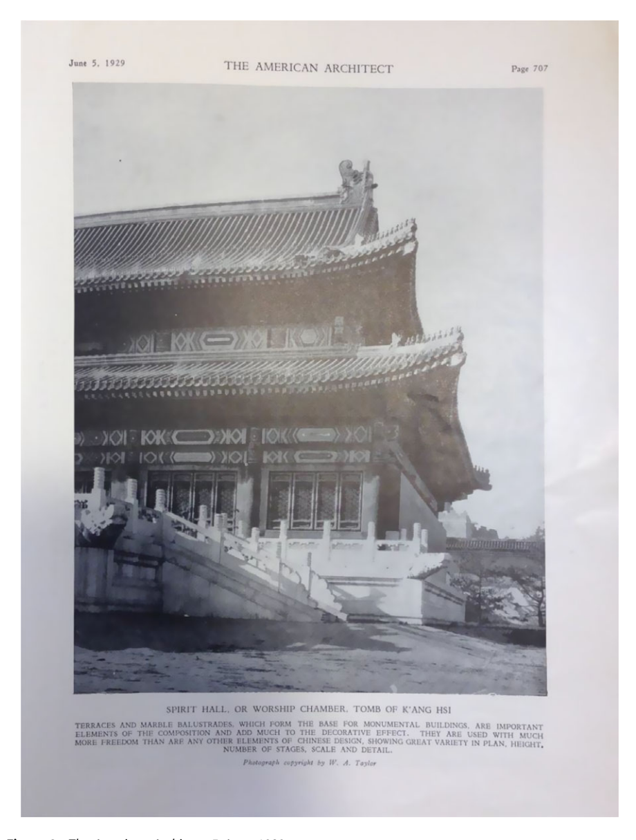
Figure 3. The American Architect, 5 June 1929.

Note: The caption says: 'Spirit Hall, or Worship Chamber, Tomb of K'ang Hsi. Terraces and marble balustrades, which form the base for monumental buildings, are important elements of the composition and add much to the decorative effect. They are used with much more freedom than are any other elements of Chinese design, showing great variety in plan, height, number of stages, scale and detail.'