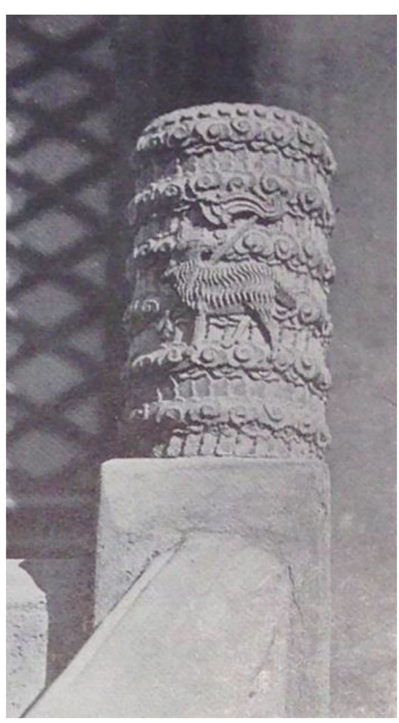
Figure 8. The American Architect , 5 June 1929.