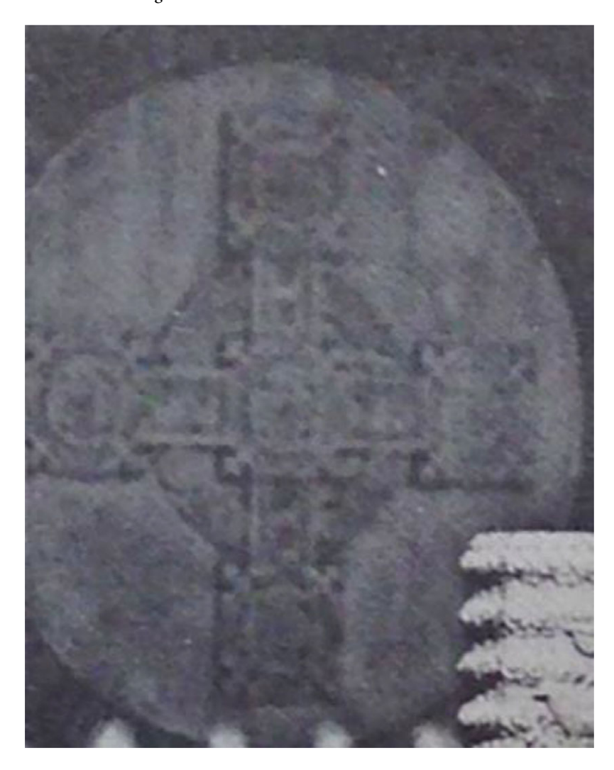
Figure 9. The American Architect, 5 June 1929.

know. However, we can venture to hypothesize that the way the Chinese perceived his own work did matter to him. One sign of this is how bothered he was by the attitude of some missionaries, or foreigners in general, whose lack of curiosity and interest in Chinese culture and people were blatant. In a letter to his family, he wrote about foreigners in Hankow: