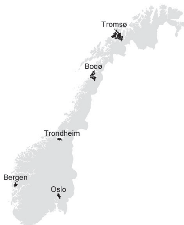
Fig. 1. The municipalities where participants were recruited. Basic map data: Norwegian Mapping Authority (cc-by-sa-3.0).

inhabitants (Statistics Norway, 2008), most elementary schools (Pedlex Norsk Skoleinformasjon, 2010) and the largest area of urban settlement (Norwegian Mapping Authority, 2010) (Table 1). Urban settlement area is defined by Statistics Norway as a hub of buildings inhabited by at least 200 persons where the distances between buildings do not exceed 50 metres. The average number of students in elementary schools in Oslo, Bergen, Trondheim, Bodø and Tromsø was 410, 320, 320, 220 and 170, respectively (Pedlex Norsk Skoleinformasjon, 2010).