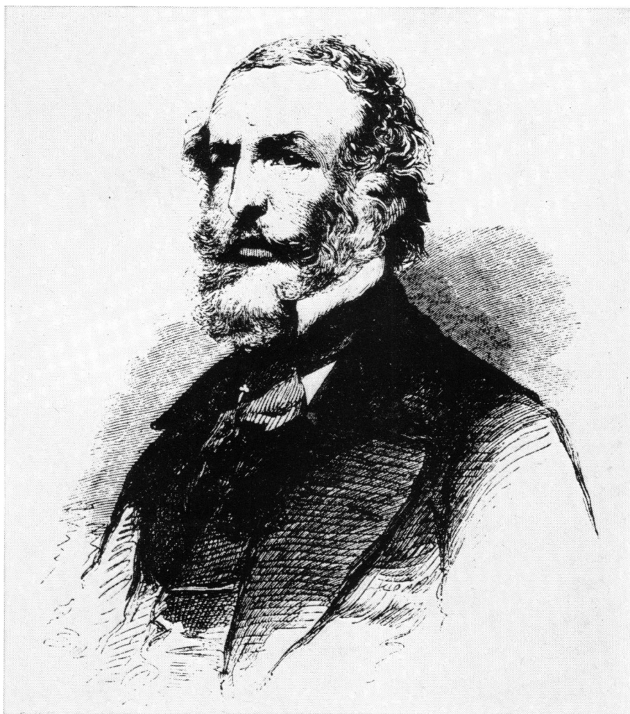
Figure 3. Portrait of John Rae. Woodcut from a photograph by Brady.