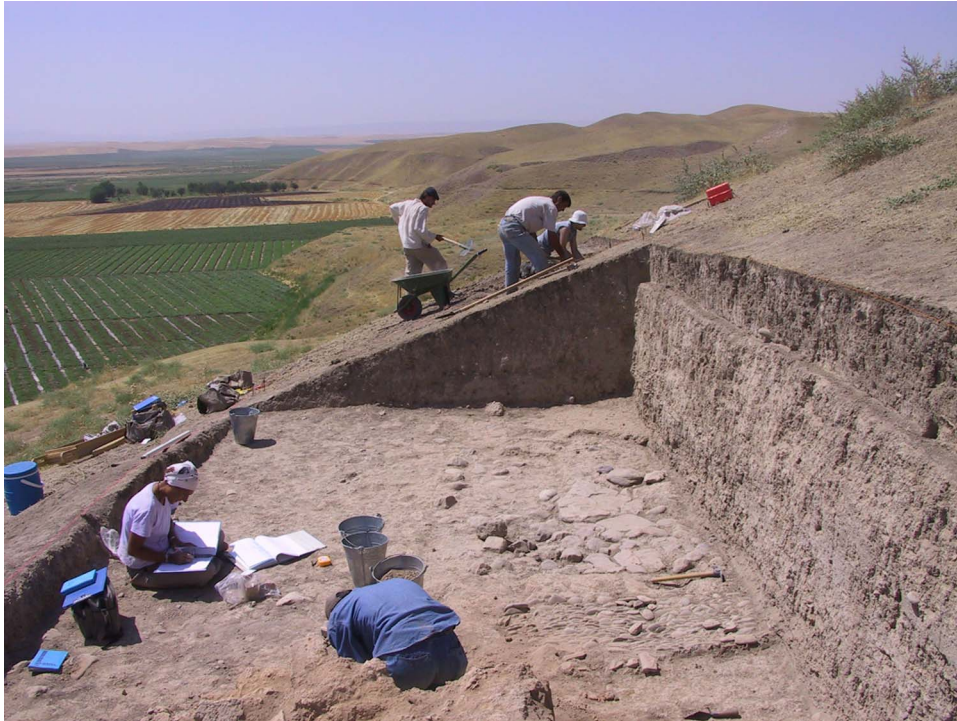
FIGURE 2. Even on the same excavation project, teams working in different trenches may use different terminology, or they may record at different levels of specificity and detail. The SLO-data project found that differences in documentation occurred especially where teams worked in trenches located far apart (Faniel et al. 2020). Having an individual whose role is to spend time in each trench can help with consistency in data collection and ease of data integration across various parts of a project. What other practices can research teams adopt to make data collection more consistent and cohesive?

on argumentation and critique helps situate data as a central concern for scholarship rather than technical proficiency with a specific software application. Archaeology offers rich opportunities to promote broader data inclusivity. Archaeologists must grapple with the interpretive challenges of incomplete and often ambiguous data (Faniel et al. 2013; Kansa 2012). Explicit documentation and justification of potentially contestable analytic steps can strengthen the rigor of archaeological knowledge claims. Emerging reproducible research practices emphasize use of open data together with greater transparency and public documentation of analytic and interpretive steps in research workflows with data (Marwick et al. 2017). If presented through accessible forms of pedagogy, reproducible research in archaeology can empower students to peer into the black box and evaluate the steps used in making claims with data.