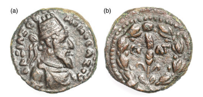
Fig. 8 Coin of Monobazos I, courtesy of Staatliche Münzsammlung München

reference to the date ( \xi \tau \sigma \varsigma ) 332 (BAT). The whole reverse image, which may be interpreted as a symbol of prosperity and well-being, is encircled with a wreath.