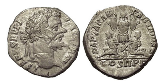
Fig. 16 Septimius Severus' coins, variant I