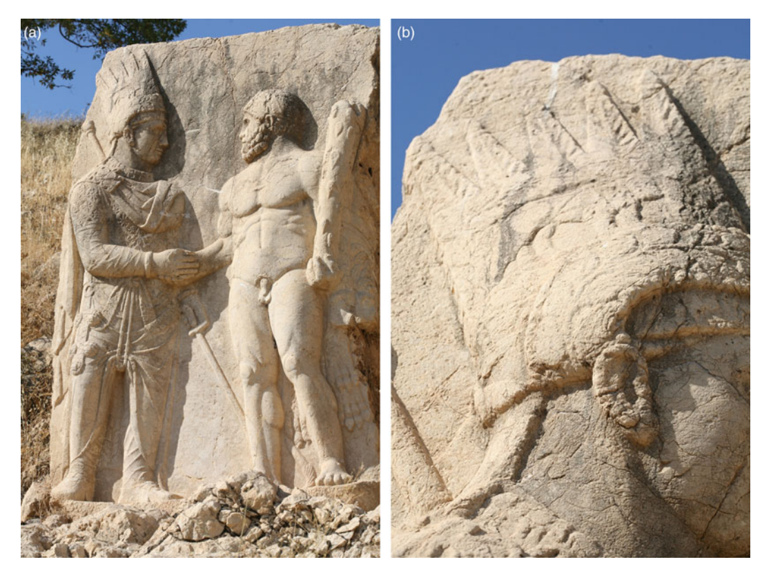
Fig. 10 Sculpture of Antiochos I of Commagene, courtesy of M.J. Olbrycht