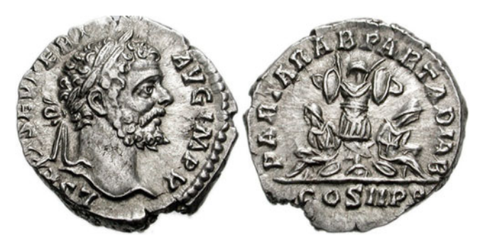
Fig. 17 Septimius Severus' coins, variant II, courtesy of the Classical Numismatic Group, Inc., www.cngcoins.com