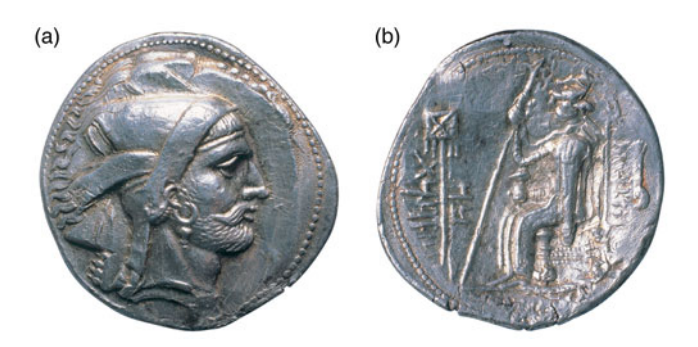
Fig. 5 Coin of Baydad