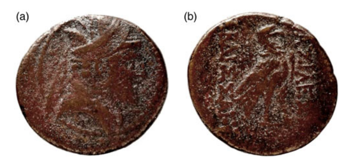
Fig. 1 Coin of Abdissar, type 1