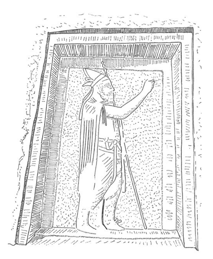
Fig. 6 Drawing of the Batas Herir relief by H. von Gall (R.M. Boehmer, H. von Gall 1973, p. 68, Abb. 2)

Maciej Grabowski has noticed a similarity between Abdissar's image on coinage and the image of an unknown ruler from Batas-Herir. In both cases, the images show male figures in conical tiaras tied with a broad diadem, and with the neck covers, and ear covers in the case of Batas-Herir, turned up. The two figures have short cropped beards and short hair visible under their headdresses. According to Grabowski, this may indicate that Abdissar and the figure from the rock-carved relief at Batas-Herir are one and the same.<sup>39</sup> This hypothesis may be considered plausible from an iconographic as well as a chronological perspective. This new manner of wearing the soft tiara originated in the late third to the early second century B.C.E. It can be found on the coins issued under the rulers of