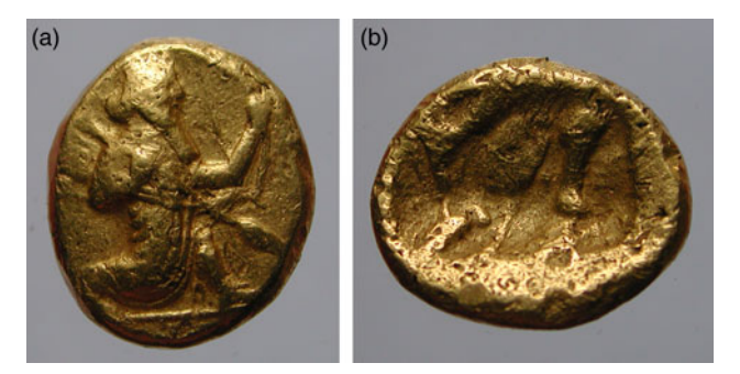
Fig. 13 Persian coin, courtesy of the Hutten-Czapski Museum in Kraków, coin no. MNK-VII-A-6444

of the images from Persepolis, M. Roaf observes that "dentate" crowns would have been worn by courtiers as well as the king. 107 This remark might just as well be applied to the "dentate" tiara, even though no such representation has been confirmed during the reign of the Achaemenid dynasty. Following the fall of the Achaemenid Empire, the insignia of royal and satrapal authority, such as diadems and various types of tiaras, were adopted by the rulers of various successor states. One of such insignia, the "dentate" tiara, became part of the regalia of Armenian kings. However, the details of how this occurred remain unknown. Likewise, we do not know why King Monobazos was portrayed wearing a tiara that was clearly influenced by the Armenian type. Without additional historical sources, we are able to do little more than speculate. In the first century C.E., Adiabene reached the peak of its political power. To a certain extent, it temporarily supplanted Armenia as the prominent force in that area of the Near East (incidentally, according