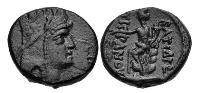
Fig. 9 Coin of Tigranes II, courtesy of the Classical Numismatic Group, Inc., www.cngcoins.com