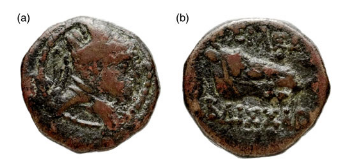
Fig. 3 Coin of Abdissar, type 3, Bibliothèque nationale de France