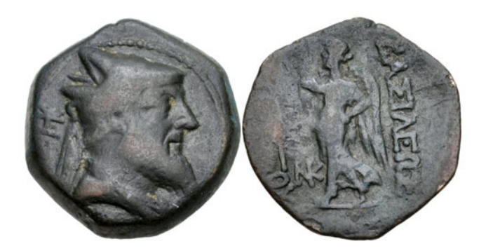
Fig. 4 Coin of Xerxes