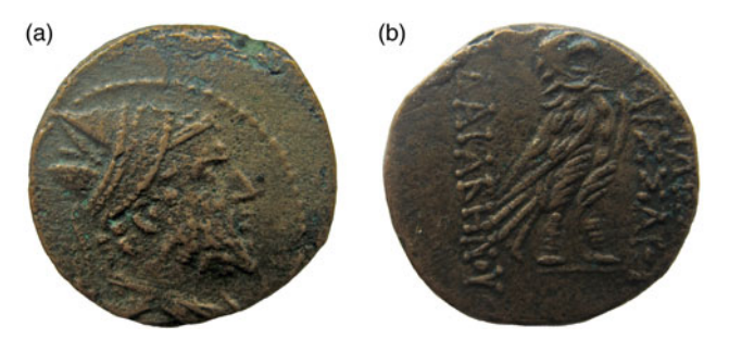
Fig. 2 Coin of Abdissar, type 2, courtesy of F. de Callataÿ, Bibliothèque royale de Belgique, Inv. II, 81.698