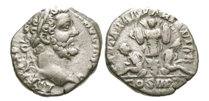
Fig. 15 Septimius Severus' coins, variant I