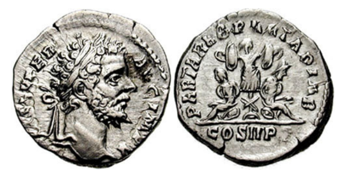
Fig. 18 Septimius Severus' coins, variant II, courtesy of the Classical Numismatic Group, Inc., www.cngcoins.com