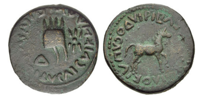
Fig. 11 Coin of Artaxias III