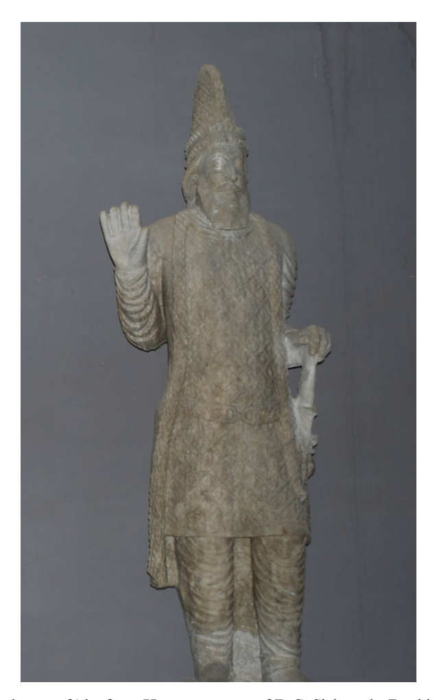
Fig. 14 Sculpture of 'tlw from Hatra, courtesy of D.C. Siebrandt, Deakin University

tunics can be found in the art of Hatra as well (notably on a statue of King Vorod [Orodes]<sup>139</sup> and a statue of an unidentified ruler<sup>140</sup>). Images of tiaras in Hatra, such as the tiara of Sanatruq II, king of Hatra, <sup>141</sup> and the head of a statue of an unidentified ruler, <sup>142</sup> display a close resemblance to the tiara of the king of Adiabene.