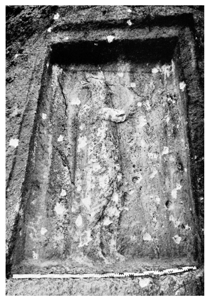
The Batas Herir relief (R.M. Boehmer, H. von Gall 1973, Tafel 28)

the first half of the second century B.C.E. (Xerxes, Abdissar, and Baydad). Considering the distinctive tiara depicted in the relief of Batas-Herir, it would likewise be datable to the first half of the second century B.C.E., i.e., during Abdissar's reign. Moreover, the geographical location of this site (northern Mesopotamia) appears to support Grabowski's proposition.