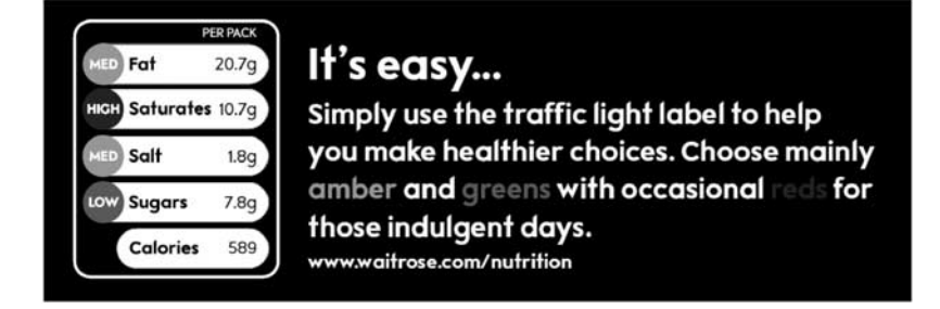
Fig. 1 Exemplary illustration of the traffic light signposting labelling format<sup>(57)</sup>