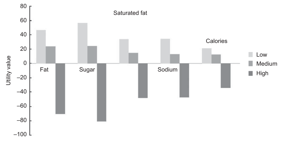
Fig. 3 Graphical illustration of utility values for all nutrients