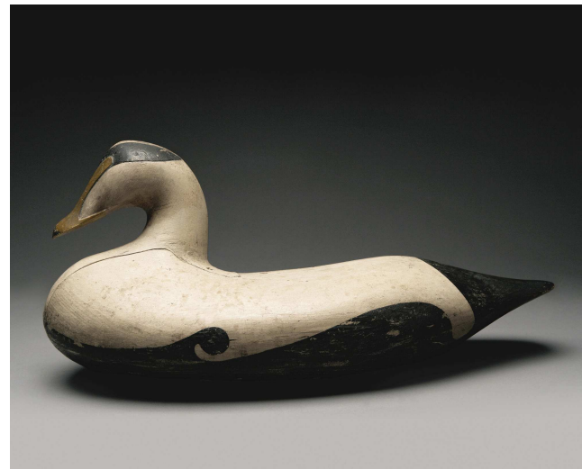
FIGURE 2: A rare Edier Drake sculpture taken from the official Sotheby's web site.

Procedure. The participants were told that the study at hand was meant to examine how people go about buying or selling antiques. The scenario was that of an individual who had recently inherited a small sculpture of a duck