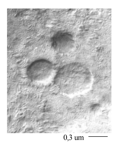
Figure 1. TEM permanganic etching followed by replication, LLDPE/iPP