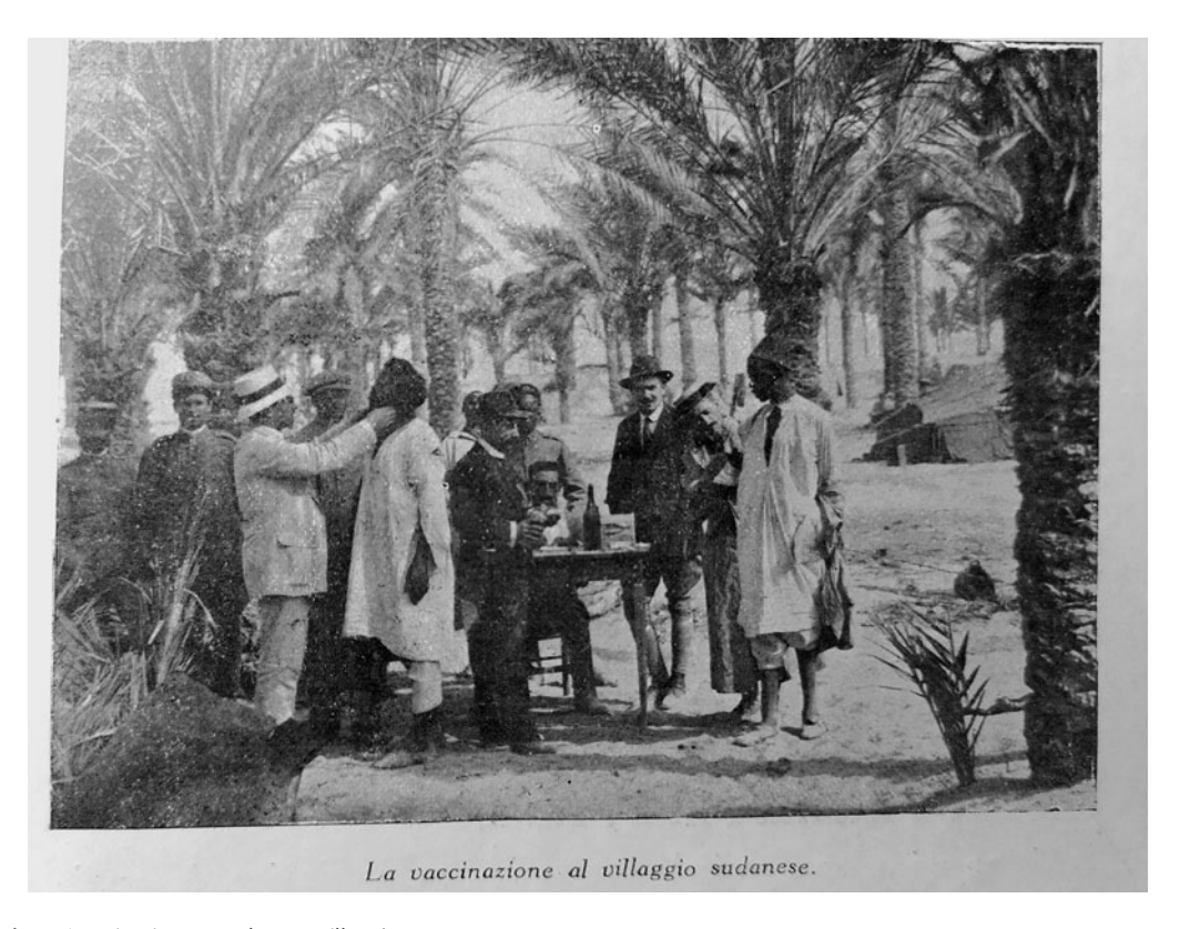
Fig 3. 'Vaccination at Sudanese Village'

Sallabbi not only organised the visit but acted also as a mediator for the anthropologist, explaining to him that in the village there were two main groups of mutually understandable dialects, one composed by Salamat, Dagiu, and Rascièt groups, the other by Saràua and Baghirmi. The other four groups in the village spoke different dialects without any linguistic affinity with each other. 100