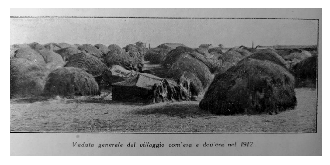
Fig. 2. Little Wadai/Sudanese Village 'Overview of the village as it was and where it was in 1912'. Source: U. Tegani, Bengasi: uno studio coloniale (Milan, 1920), 140.