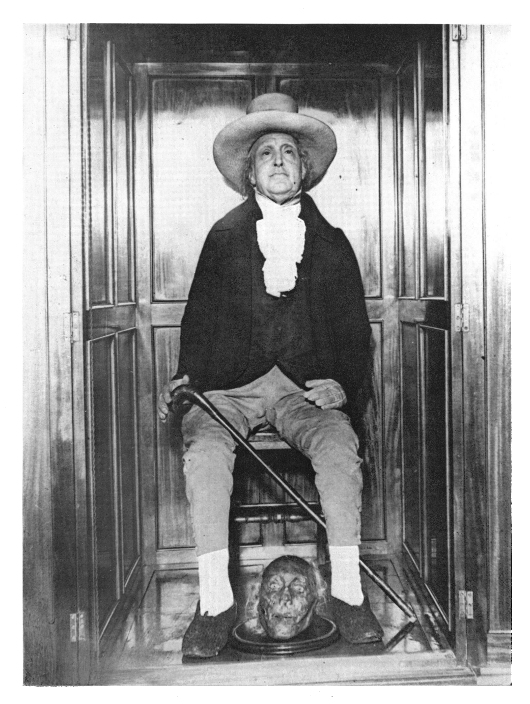
Fig. 2 The seated figure of Jeremy Bentham in the original case. For this photograph (taken in March 1948) the mummified head was replaced in the position it occupied before the war; it is now kept in a small oak chest nearby.