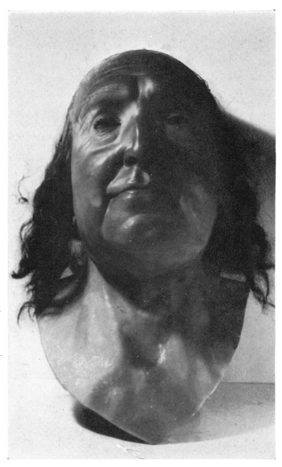
Fig. 3 The wax head before and after cleaning in 1939.