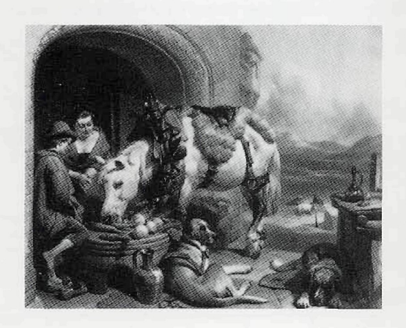
image is accompanied by a brief descriptive paragraph that adds a fascinating portrait of the taste and interests of the time.

Filled with unique images, this exquisite volume offers the reader a rare look at Dancer's work. The more than 844 images and illustrations are reproduced in rich duotone color, from the original collodion-on-glass negatives. Not only are the photographs a window to the past, but each