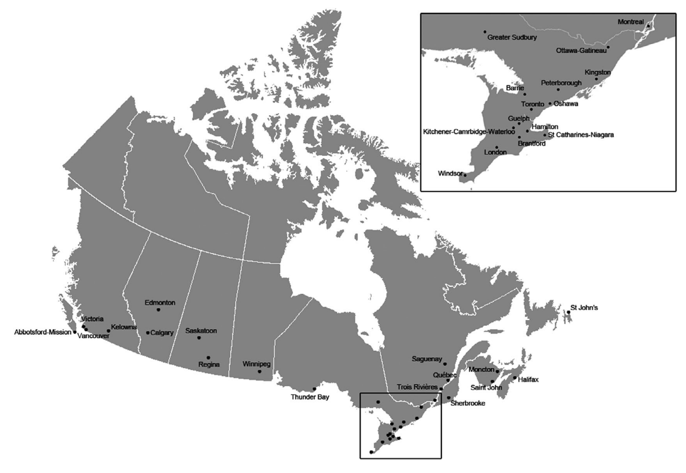
Figure 2. Map of 33 case study cities (CMAs).

goal was to determine whether older Canadians disadvantaged by social determinants of health are more likely to be living in more or less supportive environments. To do so, we examined every neighbourhood in all 33 of Canada's major cities (as defined by their CMA, and henceforth referred to as cities ). The location of the case study cities is depicted in Figure 2. Census tracts, as defined by Statistics Canada, were used as a proxy for neighbourhoods. In total, 5,299 census tracts were included in the analysis.