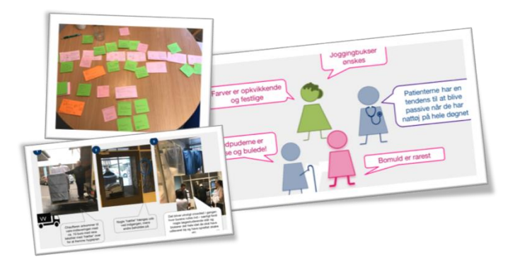
Figure 2: Examples of intermediary objects

give them an idea of what was the basis of the future negotiations. As the CEO of the washing equipment manufacturer was quite busy and the same time reluctant in making any changes in his business model the key actors was at this point: the CEO of the laundry, a local representative from a Danish textile company currently collaborating with the professional laundry, and the facilities managers at the hospital. The representative from the textile company was involved as his company had invented a new type of weaving that would prolong the lifetime of their textiles while still being comfortable to wear. This new textile would also benefit the professional laundry as it required less drying time and thus reduced energy consumption.