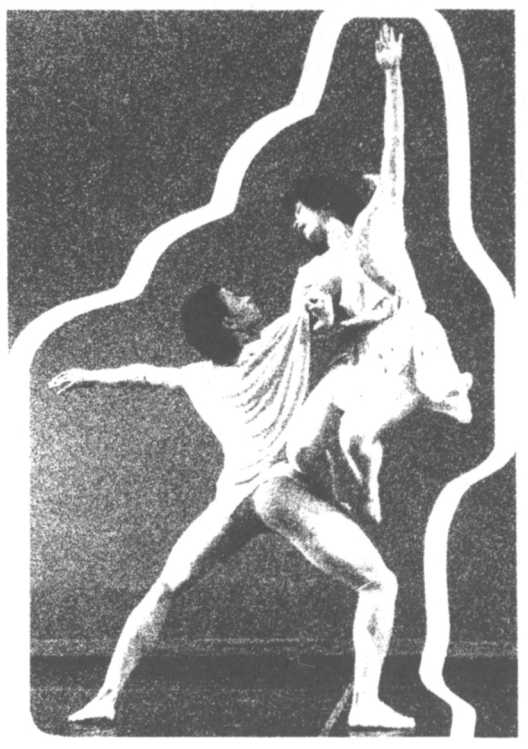
UCLA Dance Company, 1987

UCIA Department of Dance Dance Building, Room 124 Los Angeles, CA 90024 (213) 825-3951