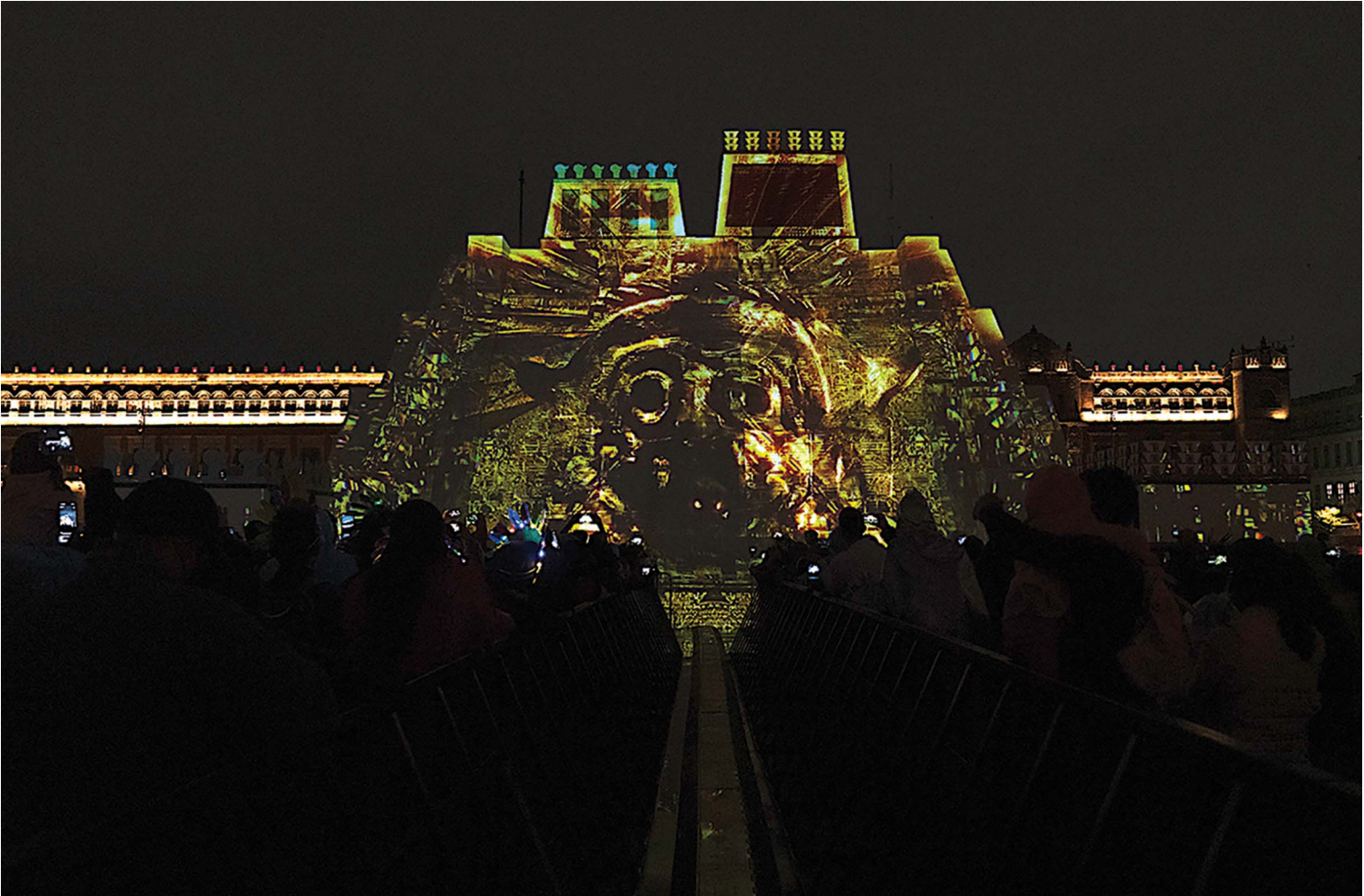
Figure 1. The Aztec god, Tlāloc, projected onto a temporary replica of the Templo Mayor in the Zócalo, Mexico City. The 'Memoria Luminosa' audio-visual experience, August–September 2021, was organised by Maizz in collaboration with Mexico City's Secretary of Culture. https://www.maizz.mx (photograph © Maizz).