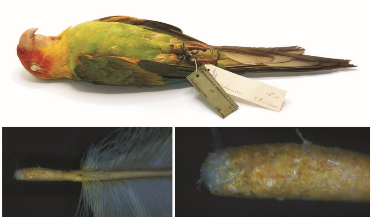
Figure 1. Specimen of the Carolina Parakeet housed in the Bavarian State Collection of Zoology, Munich, Germany, and the infested feather quill.