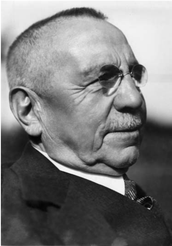
Figure 2. Edouard Anseele.

unlikely that these bourgeois francophone Orangists were able to exert a direct influence because there were hardly any contacts between them and the early Ghent socialists. 58 It is more likely that we are dealing with a popular, relatively autonomous remnant of Orangism.