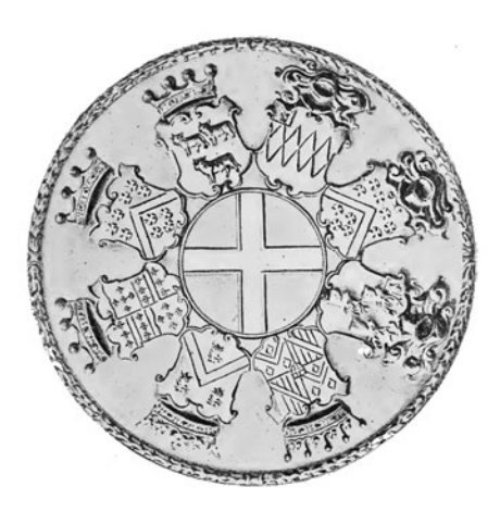
Figure 6—The two sides of the Seal of the Province of Carolina (1663).

granting charters to proprietors, but not colonization societies, acquired new (royal) colonies, and consolidated old ones. The Indian emerged as a new symbol of colonization, while the old Puritan Indian icons of Massachusetts Bay, Plymouth, and (briefly) Connecticut were quite literally erased. This new Indian not only looked different; he and/or she (depending on the seal) signaled a different version of colonial ideology. The guiding aphorisms of late Stuart seal mottoes came not from the Bible but from classical republican writers. Royal colonies adopted images of Indians as subordinates, integrated into the political economy of the Atlantic economy. Some proprietary colonies followed suit or eliminated Indians altogether, focusing instead on the benefits of the colonial political economy to European colonists.