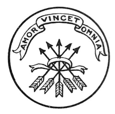
Figure 4—A later imagining of the original 1641 seal design of Newport, edited from a drawing by the Newport Historical Society. Source: Eugene Zieber, Heraldry in America (Philadelphia, 1895), 181. The banner reads Amor Vincet Omnia (Love conquers all). (No image or copy of the original seal survives, and it is possible that it was never was made.)

Connecticut River Valley. The just claim to authority rests neither on agriculturalist arguments, nor on just purchase and friendly alliance, but with divine intervention in the clearance of land for settlement either by plague or through warfare (figure 5). The seal depicted fifteen grapevines with a hand reaching down from the sky holding a banner reading Sustinet Qui Transtulit (He who transplants, sustains). The transplanted grapevines refer to settlers from England and Massachusetts who flocked to the Connecticut River Valley during the 1630s on the heels of a devastating smallpox outbreak among Indigenous communities, and who planned a wave of further migration from England.<sup>65</sup> (It failed to materialize.) The seal was originally brought from England in 1639 to Saybrook, a small fortified settlement on the Southern New England coast, the site of the planned migration. It was soon adopted by Connecticut in 1644, to whom the Saybrook leadership sold their stake, including the seal. The motto is a likely reference to passages in the 80th Psalm, 8-9, 14-16 (Geneva 1599) "Thou hast brought a vine out of Egypt: thou hast cast out the heathen, and planted it. Thou madest roume for it, and didest cause it to take roote, and it filled the land."66