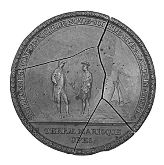
Figure 12—Obverse side of the Seal of Nova Scotia, George III (1767). (The original George II image, nearly identical, may be found in Swan, Canada: Symbols of Sovereignty , 127.)

imperial system in which the monarch is not depicted, but prosperity and territory are. This seal also marks the last new depiction of the Indian, as such, in a British colonial seal before the American Revolution.