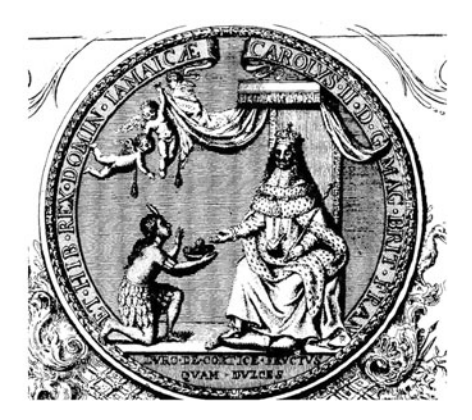
Figure 7—The Great Seal of Jamaica under Charles II. Source: George Vertue, Medals, Coins, Great Seals, and Other Works of Thomas Simon (London, 1780), plate 36.

particular interpretation except perhaps that, unlike the New England Indians, they are not atomized, Edenic, or in crisis.