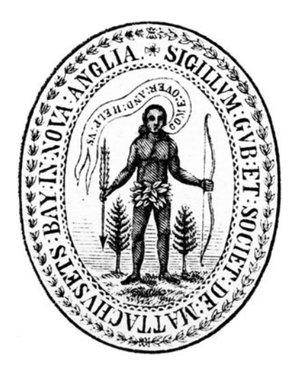
Figure 2—Seal of the Governor and Company of Massachusetts Bay in New England (1629), reproduction. Source: Nathaniel B. Shurtleff, ed., Records of the Governor and Company of the Massachusetts Bay in New England , 5 vols. (Boston, 1853–1854) (the image is reproduced on the cover of each of the five volumes). There is no evidence to corroborate whether this nineteenth-century print was an attempt at an exact representation of a now lost original (1629) image or whether it was a copy of later seventeenth-century versions. The iconography did not vary among versions.

European visual cues of Indianness. <sup>42</sup> That the words issuing from the Indian's mouth should be in English reflected the Puritan insistence on the use of the vernacular in worship and, like the image of the Indian, were an innovation in seal design. They were not an innovation in print imagery, however, and reflected graphic satire conventions of the time. In this way, the image can also be read as a political statement. <sup>43</sup> Likewise, the trees appear less as a symbol of something related to just claims of authority than an evocation of the eyewitness style of Indian depiction popular at the time. <sup>44</sup>