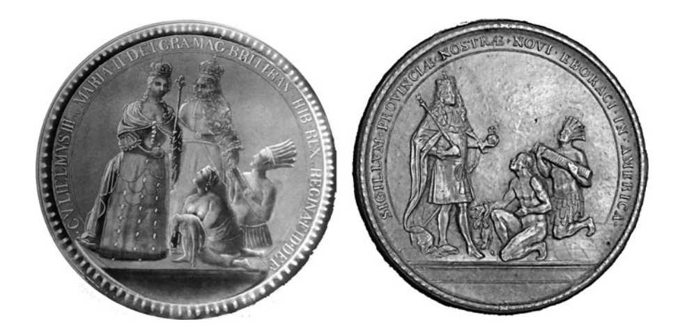
Figure 9—Left, Obverse side of the Great Seal of the Province of New York, 1691–1705; right, Obverse side of the George II Seal of New York. Sources: William and Mary seal, E. B. O'Callaghan, The Documentary History of the State of New-York, vol. 4 (Albany, 1851), plate 4 (description, "Seal of King William and Queen Mary," at *2-*3); George II seal, photo from author's private collection. Courtesy of the Royal Mint.

improvement or salvation. This representation is in sharp contrast with what the colonist offers: a symbolic show of submission (the doff of the hat) that acknowledges the sovereignty of the monarch and, reciprocally, his own status as a subject.