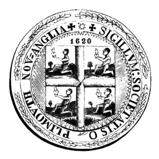
Figure 3—Seal of the Colony of Plymouth, New England (ca. 1629), reproduction.

project: how to legally (and morally) justify settlement on occupied land. Unlike the Spanish, who drew from their experiences of the Iberian reconquista to organize the conquest and domination of New World peoples, the English focused their energies on claims to the land and viewed Indigenous people with sovereign separation from the settlement process. 46