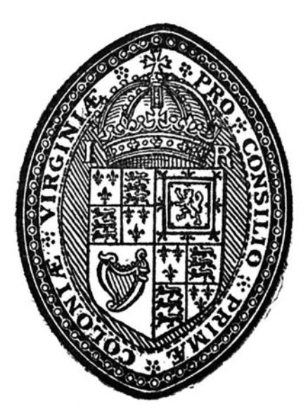
Figure 1—Seal of the First Council of Virginia (1606), in use by Virginia Colony until 1652. With the exception of the inscription on the reverse, similar seals were authorized for Newfoundland (1610) and Nova Scotia (1622). Source: Lyon G. Tyler, "The Seal of Virginia," William and Mary Quarterly 3 no. 2 (1894): 81–96, at 83.

Portraiture on the other." Around the border of each was written, on one side, "Sigillum Regis Magne Britanniae, Franciae, & Hiberniae (Seal of the King of Great Britain, France, and Ireland), while on the other side the inscription indicated whether it was a local seal or one of the Supreme Council (figure 1).