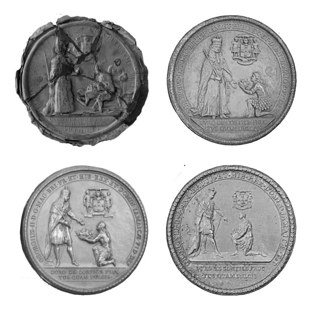
Figure 11—Obverse side of the Queen Anne, George I, George II, and George III Seals of Jamaica. Not until George III did seals drop the image of the Indian in favor of an African.

feet. In the background is a map of the coast of Nova Scotia, with a fishing vessel and net off its coast. The fur trade, balanced with the benefits of rich fishing grounds, are the primary benefits (to the crown and to Europeans) of this new territory—an impression confirmed by the motto Terrae Marisque Opes (The resources of land and sea). The Indian stands as a symbol of those resources through trade (importantly, not tribute, which would be better signified by an Indian on his knees). This depiction of imperium, putting colonist and Indian literally on the same footing, was not an indication of their equal civic standing within the colony of Nova Scotia but rather the benefit of the imperial system writ large, in which the colonist would benefit from British rule. Unlike previous seals, this image signals a more abstract