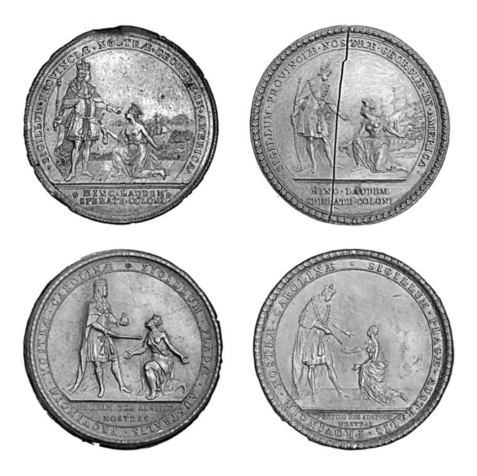
Figure 13—Obverse side of the Seals of the Royal Colonies of Georgia and South Carolina, for George II and George III respectively.

colony as well as the continuing hopes for its future as a site of silk production. The significance of silk is also alluded to in the motto Hinc Laudem Sperate Coloni (Hence, hope for praise o [agricultural] colonists). The quote is a reference to Virgil's Georgics —a ubiquitous source of Hanoverian seal quotation—and refers to the economic difficulties of the colony and its supposed future in silk. <sup>96</sup> (A looser translation today might read, "Hang in there, silk farmers!") The Indian woman and the substantive meaning of the seal are disconnected. She no longer indicates, as previous Indian representations had done for over a century, the positioning of Indigenous peoples in just claims of authority in dominium and imperium. Instead, she joins Indian depictions in European fine art: Europa's sister symbol for America—not a metonymy but an allegory, a longstanding trope in other