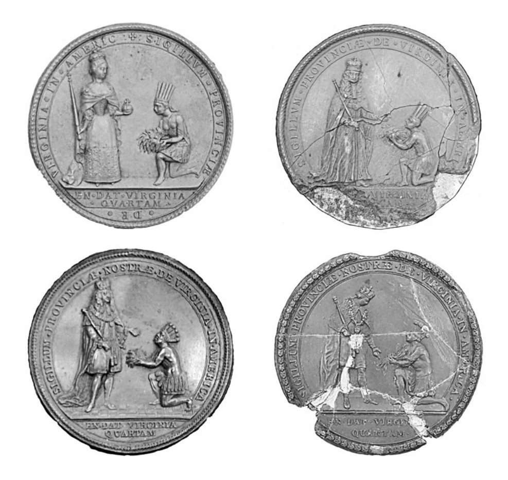
Figure 10—Obverse side of the Queen Anne and George I, II, and III Seals of Virginia Colony.

The Restoration seal of Jamaica followed the same pattern, replacing the old version of the Jamaica coat of arms on the reverse with the standard royal arms used to back all double-sided royal colony seals, and putting a small version of the Jamaica arms on the obverse while employing the standard kneeling Indian offering native goods to the monarch (figure 11). By the time of George III, the Indian disappeared from Jamaica's seal, replaced by a solitary African man on his knees—an acknowledgment of the demographic transformation of the island.<sup>85</sup>