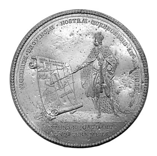
Figure 14—Obverse side of the George III Seal of the Province of Quebec. Author's private collection. Courtesy of the Royal Mint.

forms of seventeenth and eighteenth-century depiction of Indians.<sup>97</sup> The legitimacy claim within the seal is of the monarch answering the colonist's call for his potent intervention—Zeus shining on Danae.