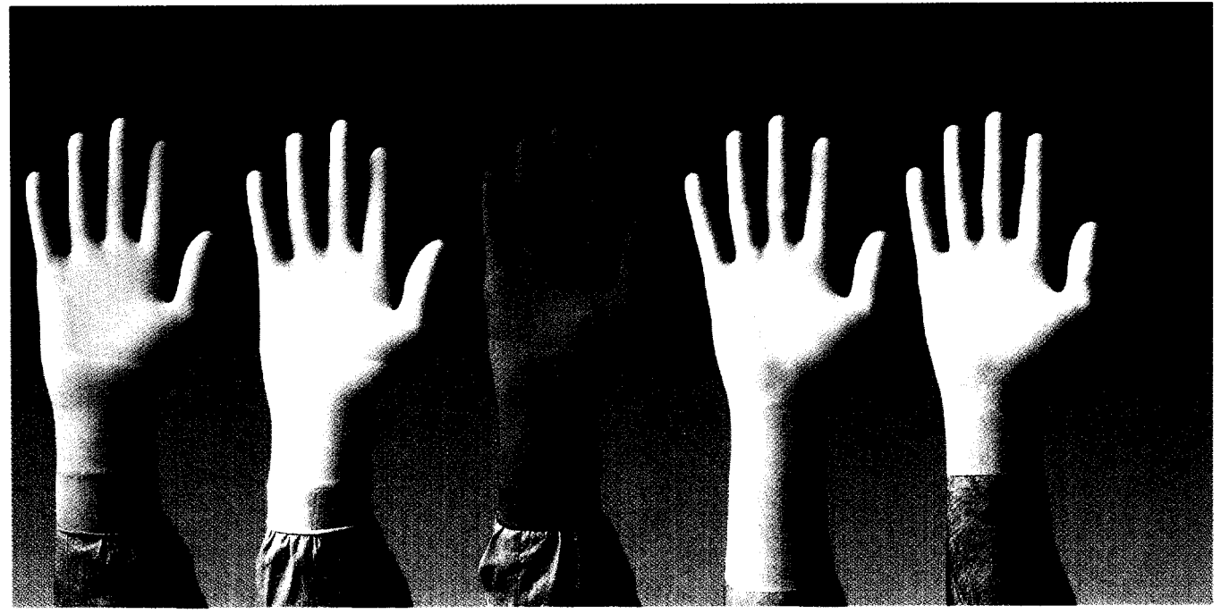
NEUTRALON' Brown Surgical Glove MICRO-TOUCH' Latex Surgical Glove MAXXUS' Orthopaedic Surgical Glove MICRO TOUCH' XP Latex Medical Glove MICRO-TOUCH' Latex Medical Glove

Protection. The key to our superior glove line. At Johnson & lohnson Medical, Inc., we have a reputation that spans more than 20 years — years dedicated to the research and development of quality gloves that provide maximum protection, optimum fit and excellent touch sensitivity.