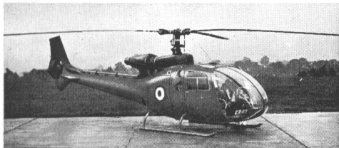
Gazelle French Army