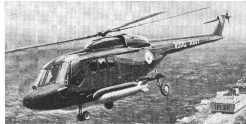
Lynx Royal Navy