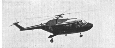
Lynx French Navy