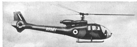
Gazelle British Army