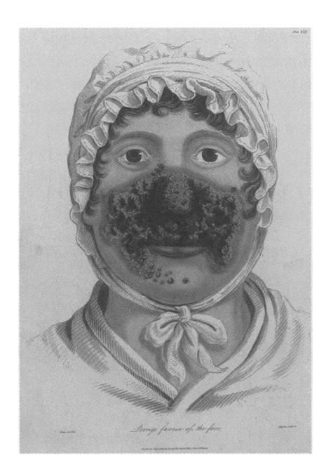
Figure 15: Porrigo favosa, normally a disease of the scalp but here affecting the face. From Thomas Bateman's Delineations of cutaneous diseases, London, H. D. Bohn, 1840.