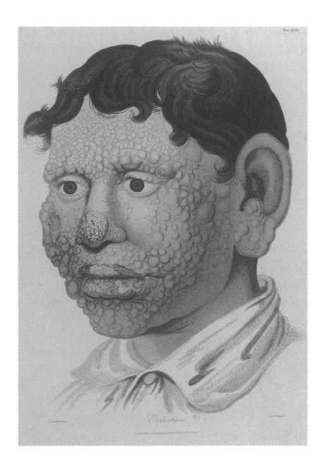
Figure 16: Elephantiasis. From Thomas Bateman's Delineations of cutaneous diseases, London, H. D. Bohn, 1840.