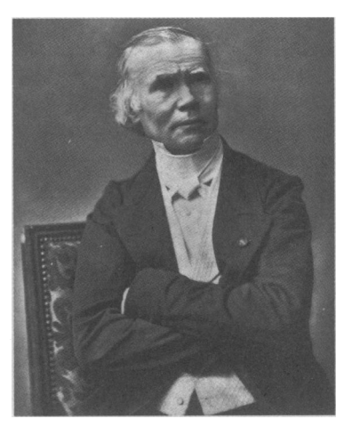
Figure 18: Alfred Armand Louis Marie Velpeau (1795–1867).