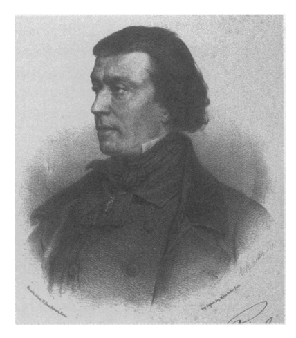
Figure 17: Philippe Ricord (1800–89). Lithograph by L. Valentin.