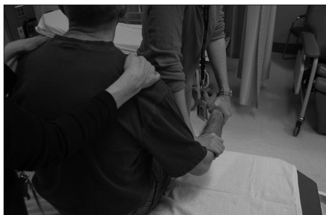
Fig. 2. Levering the arm into slight abduction while maintaining downward pressure.

way and most people appear to have less pain at this point. This may be because the humeral head is disimpacted. This seems to be more difficult to accomplish with the patient in a supine position. Also, it's easier to apply greater force on the arm by using one's body weight than by pulling on it against gravity (Fig. 1).