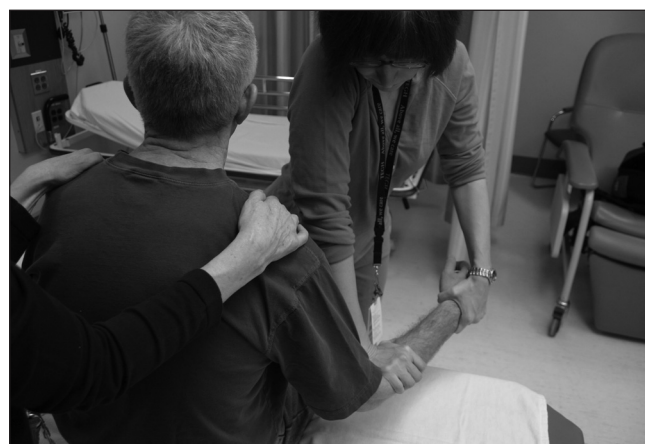
Fig. 3. Slight eversion may also be helpful as long as traction is maintained.

From the Department of Emergency Medicine, Toronto East General Hospital, Toronto, Ont.