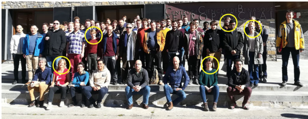
Figure 1. Typical low participation of women in physics conferences (yellow circles), for example at the Workshop on Entanglement in Strongly Correlated Systems, Benasque, Spain Feb. 2020

from being protagonists in decision and policy making. Few exceptions confirm the rule and men continue to dominate the field.