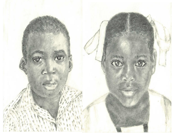
Figure A1. Sample stimuli from the Face-Name Binding Test (FNBT).

When designing the overall cognitive test protocol, we selected NEPSY-II subtests to assess the convergent and divergent validity of GLAMS subtests. Given the limited attention spans of preschool children, we prioritized subtests that were quick, simple to administer across various contexts (clinics, schools, homes) and considered culturally appropriate by Grenadian members of the study team. To assess convergent validity, we considered all of the preschool memory domain subtests from the NEPSY-II. There were concerns raised about the cultural familiarity and administration time/burden of the Narrative