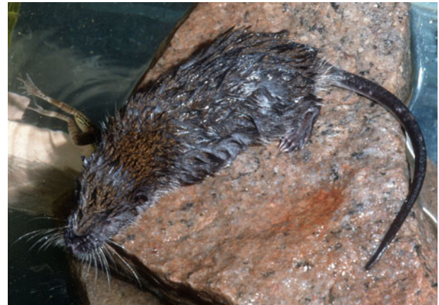
PLATE 1 The aquatic tenrec Microgale mergulus is categorized as Vulnerable because of its restricted number of known sites (10) and limited area of occupancy (< 2,000 km 2 ).

All threatened tenrec species are known from only a few individuals captured at 10 or fewer locations, making it hard to determine accurately their distribution, abundance, habitat preferences, or population trends. There have been few ecological studies and little information exists on tenrec behaviour. Few Malagasy protected areas have monitoring schemes in place. In addition, tenrec taxonomy is changing regularly as a result of ongoing genetic analyses and