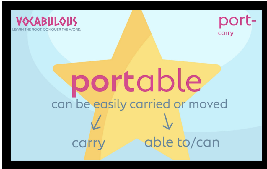
Figure 2. Video teaching the word 'portable' and breaking it down into root and suffix.

In designing the order of the roots and derivatives in the programme, I consulted the SUBTLEX-UK database, which analyses English word frequency by looking at subtitles on UK television (see van Heuven et al. , 2014). 2 This database analyses over 200 million word uses to produce a list of around 330,000 words in order of their frequency on television. I then identified where the derivatives from my 26 chosen roots were placed on the list and was able to give each root a 'score' as to how frequently derivatives from each of the roots were used. 'Port', meaning 'carry', came up as the most commonly used root, with the word 'important' being the most frequently used derivative on the list. 'Monolithic' was the least commonly used word, from the prefix 'mono' meaning 'one', so 'mono' is the final item to be taught on Vocabulous .