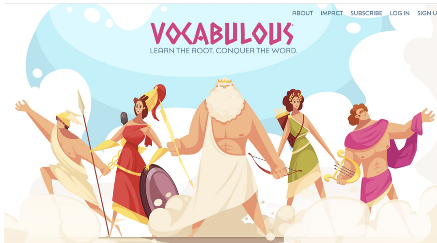
Figure 1. Screenshot of the Vocabulous homepage, www.vocabulous.co.uk .

subjects are offered, and decided to focus my efforts on the influence of Latin and Ancient Greek on English vocabulary. Vocabulary learning is a key issue in education: the Oxford Language Report stated that 43% of Year 7 students were arriving at secondary school with a poor vocabulary that limited their learning (Oxford University Press, 2018, p. 4). In addition, 92% of teachers surveyed by Oxford University Press believed that the COVID-19 pandemic and lockdowns have increased this problem (OUP, 2020). In my experience, too few students will try to work out the meaning of an unfamiliar word, and too many will simply give up if they've not met the word before. Vocabulous helps by giving students explicit training in exactly how they can deploy their knowledge of root patterns to work out the meaning of unfamiliar vocabulary, giving them skills which they can apply to complex words in any subject area.