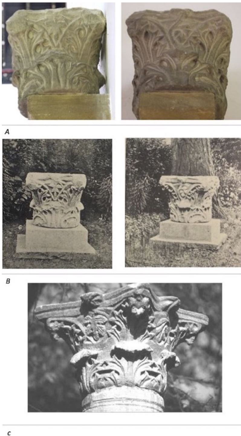
Fig 3. Lyre Capital from the Blachernai area and comparisons. A) Lyre Capital, Blachernai area, Constantinople, 5th-6th c., Lower Kingswood (Surrey), Church of the Holy Wisdom of God; B) Lyre Capital from the Blachernai area as it appears in Freshfield's Memorandum (1903); C) Lyre capital, 5th-6th c., Ayasofya courtyard (after Guiglia, Barsanti, Paribeni 2008).