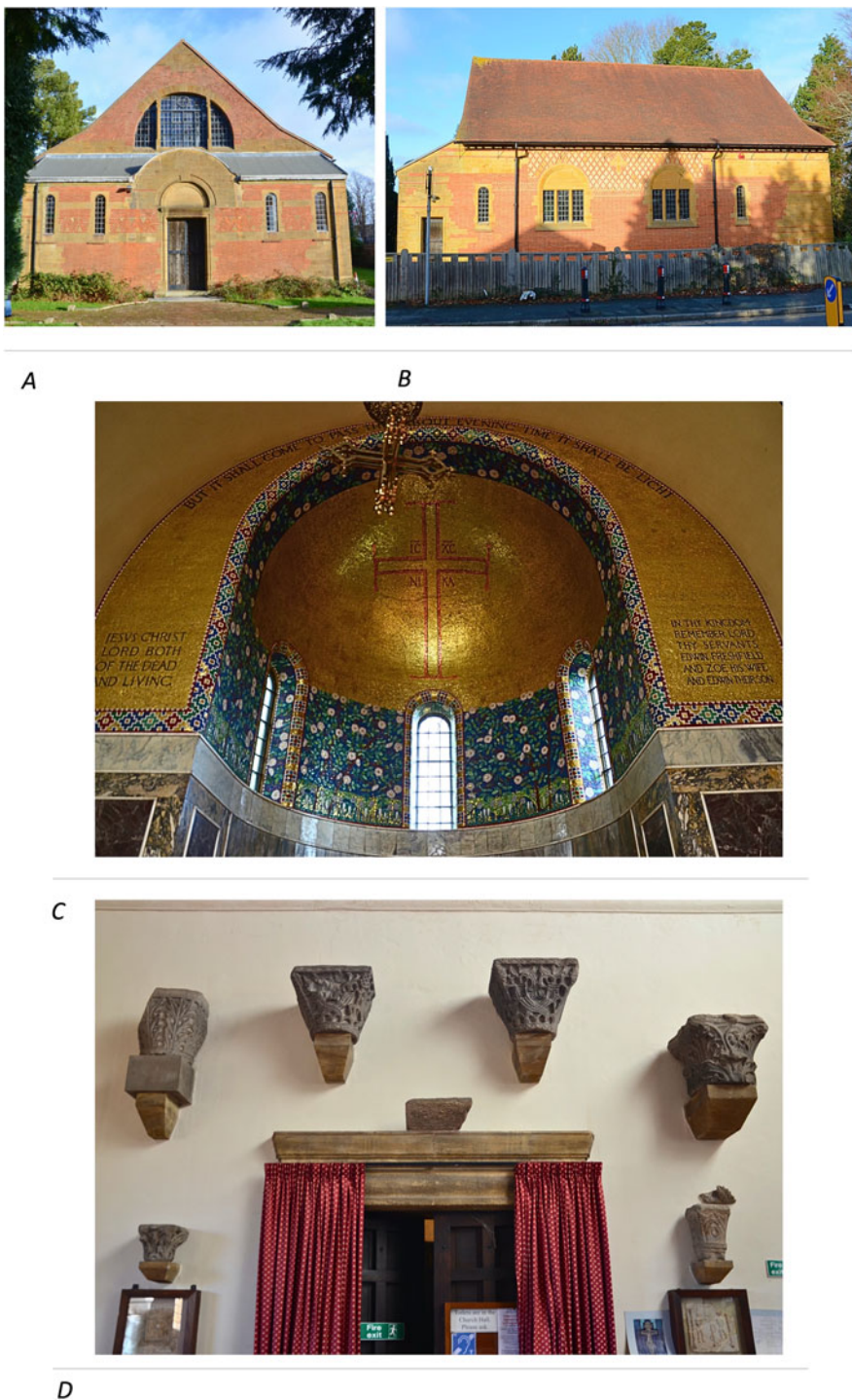
Fig 1. Church of the Holy Wisdom at Lower Kingswood (Surrey), England. A) Exterior, western façade; B) Exterior, northern façade; C) Interior, Apse mosaic showing one dedicatory inscription from Freshfield and his family (1902–3). D) Interior, western façade with most of the capitals mentioned in the Memorandum.