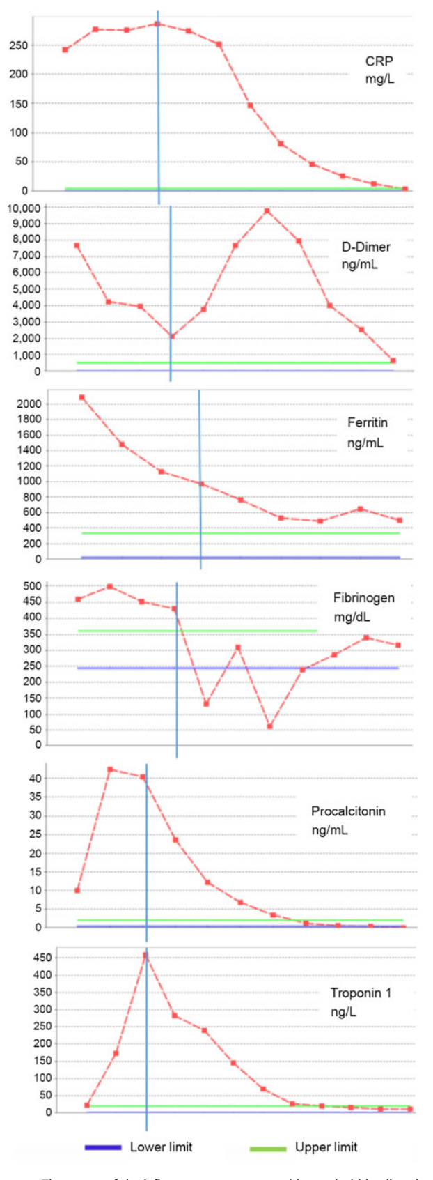
Figure 1. The course of the inflammatory parameters (the vertical blue line shows the beginning of lopinavir/ritonavir treatment).

Because aspirin may cause side effects, including Reye's syndrome, clexan (100 IU/kg/dose BD) was added to reduce blood clots. After the first intravenous immune globulin dose (2 gr/kg/dose), his fever did not improve. So, the second dose of intravenous immune globulin was given. The serologic test for the presence of IgM and IgG antibodies in plasma against COVID-19 was weakly positive. On hospital day 4, his fever decreased but pneumonia progressed (Figs 2 and 3). He had dyspnoea and complained of a nonproductive cough. SpO2 decreased to 75%. He needed high-flow nasal canula oxygen therapy, but not intubation. Oseltamivir and hydroxychloroquine were stopped and lopinavir/ritonavir (300/75 mg/day) was started. Azithromycin therapy was stopped on hospital day 5. Treatment with ampicillin-sulbactam was continued for 10 days.