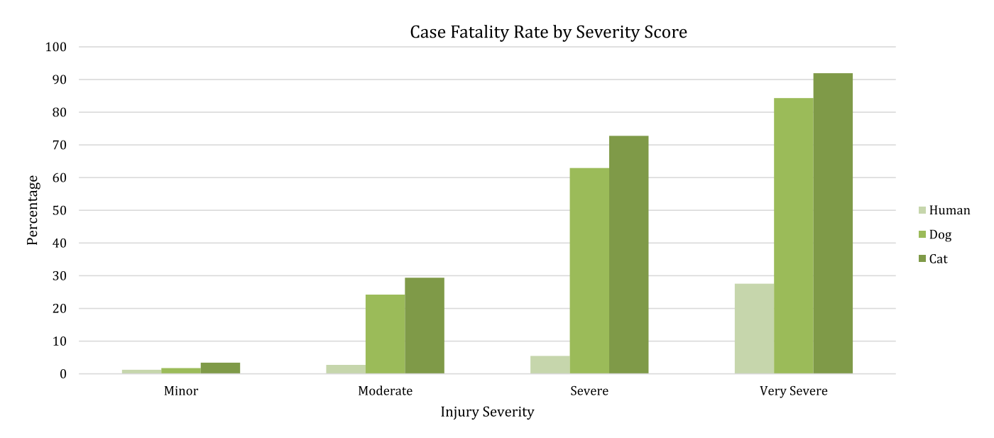
Figure 2. Case fatality rate by injury severity score in humans, dogs, and cats. Data summarized from the 2016 National Trauma Database (NTDB) and 2017–2019 Veterinary Committee on Trauma (VetCOT) registry report. Note that nonsurvival (fatality) in dogs and cats includes animals that are euthanized.

natural animal models of hemorrhagic resuscitation. In prehospital settings, humans and working dogs work shoulder to shoulder and are injured under similar conditions. Translational studies could improve outcomes for both and accelerate the path to solutions that address unmet medical needs.