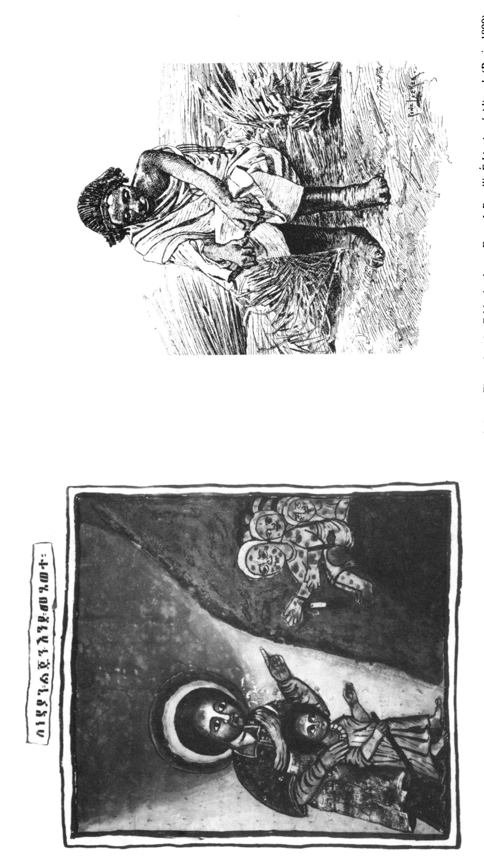
Figure 3. An Ethiopian leper. From J. Borelli, Éthiopie méridionale (Paris, 1890). Figure 2. St Lalibala and a group of lepers shown without complete fingers and with dark patches on their skin. From an early nineteenth-century manuscript in the British Library (Or. 718).