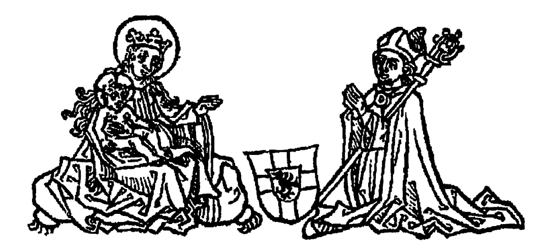
Specialist bookseller in subjects of Catholic interest

Shop in Oxford with over 10,000 vols open Mon-Sat, 10am-5pm Free catalogues on request ~ We will travel to buy collections