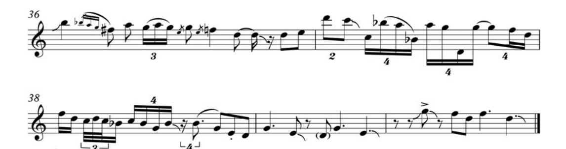
Figure 1. Continued.