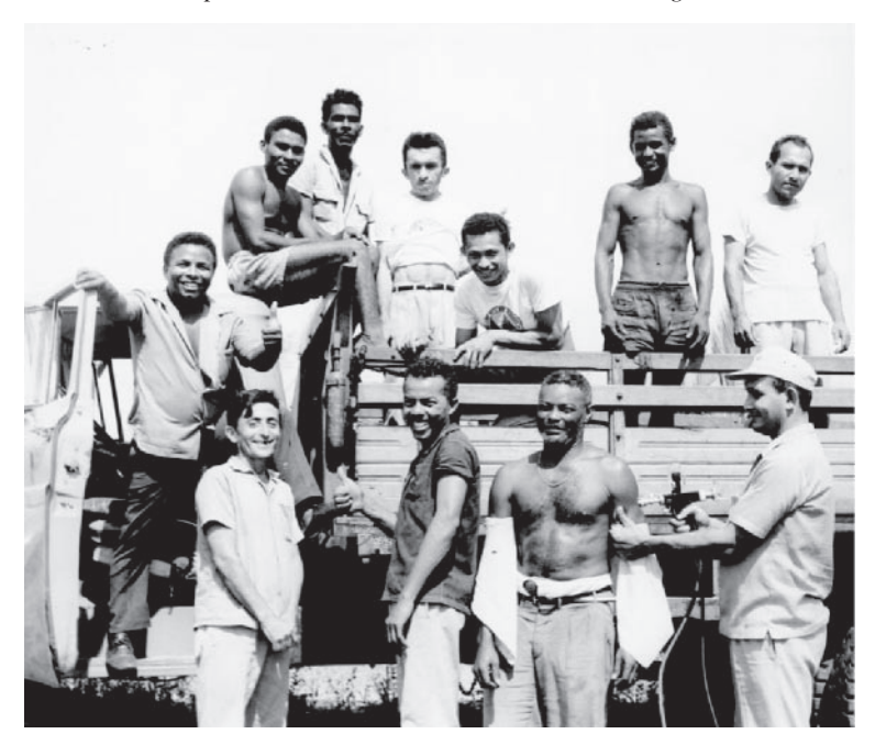
Figure 3: Vaccination of seasonal rural workers, state of Maranhão, north-east of Brazil, 1969.

simultaneously with mass vaccination activities and then continue after the attack phase had been completed.<sup>86</sup> However, as a result of financial and operational difficulties, an epidemiological surveillance system was not implemented until 1969, when the number of reported cases reached the highest level since the beginning of the smallpox campaign in 1966. The lack of good surveillance was reported to PAHO/WHO as a major barrier to eradication.<sup>87</sup> After the creation of Epidemiological Surveillance Units (Unidades de Vigilância Epidemiológicas) and Reporting Posts (Postos de Notificação) at the end of the decade, the data problem began to recede. These new surveillance functions became the responsibility of each state in the consolidation phase of the campaign, reinforcing the link among different governmental spheres.<sup>88</sup> By 1970 every state in Brazil had established an Epidemiological Surveillance Unit, and there were 6,074 Reporting Posts covering 90 per cent of Brazil's municipalities. These represented the embryo of the