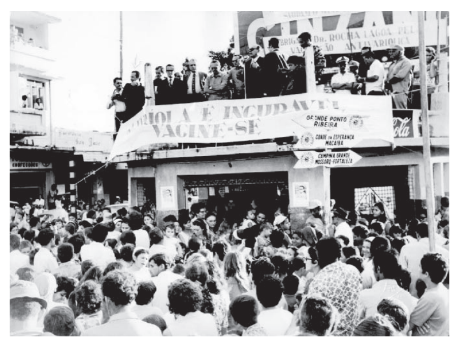
Figure 4: Politicians, officers and public health staff at the opening of the Smallpox Eradication Campaign, city of Natal, state of Rio Grande do Norte, north-east of Brazil, 1970.

National Epidemiological Surveillance System (Sistema Nacional de Vigilância Epidemiológica) established formally in 1975.<sup>89</sup>