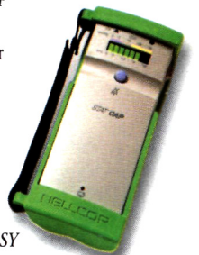
The N-60 STAT CAP Airway CO 2 Indicator

Ideal for ambulances, crash carts and emergency departments, the EASY CAP® disposable, colorimetric detector gives you fast and easy ET/CO 2 assessment for up to two hours.