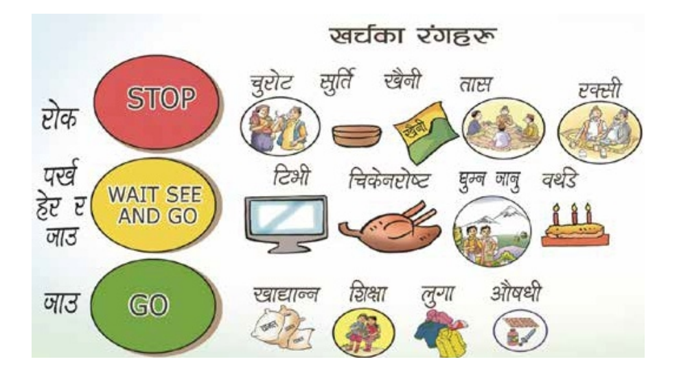
Figure 1. Traffic lights classifying desirable, cautiously desirable, and undesirable expenses.

Finally, FOR-FLE pedagogy attaches hope to insurance products. As a risk-management tool, insurance is promoted to overcome fear of emergencies, to climb the 'ladder of wealth', and to realize the promise of happiness. Insurance products are placed at an advanced stage of the ladder. Once you have reached the level of being able to manage future uncertainties through anticipatory risk management technology, you are supposed to be financially disciplined, hence, achieve happiness (SAMI, 2017; SAMRIDDHI, 2020a; Simkhada and Adhikari, 2015). Yet, to get there, transnational families need to curtail their desire to consume and instead adopt a frugal lifestyle in the present. The emotional regime of FOR-FLE establishes a 'scale of desirability' through which family expenses are classified into wants, needs and prohibitions, using a traffic light system (see Figure 1). This scale creates a hierarchy of expenses, promoting certain consumption and investments practices (Simkhada and Adhikari, 2015: 37). Through this scale of desirability, the emotional regime of FOR-FLE associates hope with saving and investments, and guilt and shame with consumer spending. This constructs the subject of the "irresponsible consumer" (Arthur, 2018: 446) who is not sufficiently frugal, does not engage in financial planning, and neither saves nor invests. By doing so, it nudges people to "consume responsibly" and adopt prescribed financial behavior in order to realize happiness and prosperity.